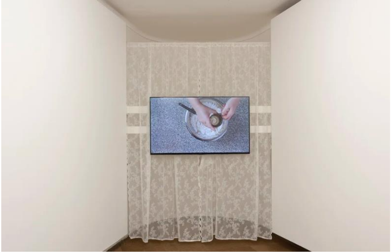
I Cook a Lot of All These Foods, 2022, Three Channel video 15:38 carpet, curtain, glazed earthenware, furniture, shoe rack, oil, moth balls Installation view, Firstdraft, Sydney.