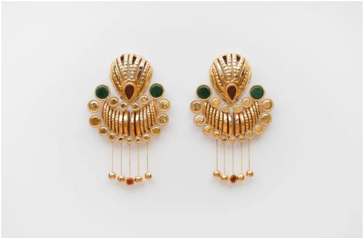
Drop Earrings That Once Belonged To My Mother, 2022 Terracotta, glaze, lustre, chain, wire, 125 x 163 cm

Draw a colourful memory vine that starts in the first panel and travels all the way through the other two. This shows that all these different memories are connected to you. At the bottom of your paper, finish this sentence: "The most important thing my family taught me is..."