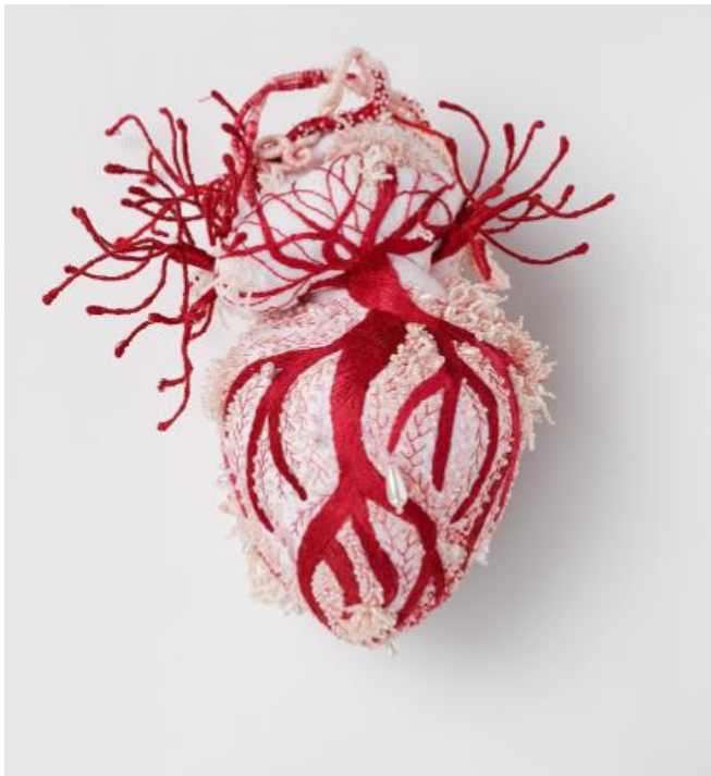
Hearts of Absent Women #12 , 2023