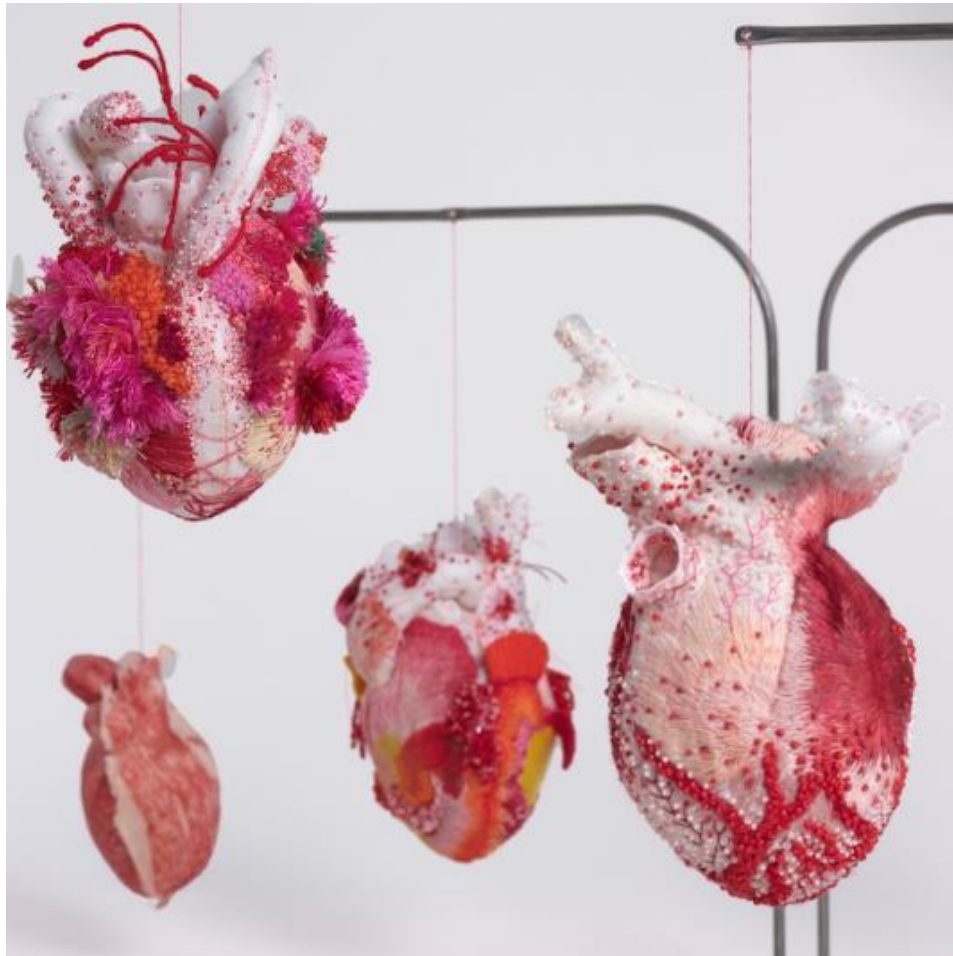
Hearts of Absent Women (detail), 2021

Find a friend and show your heart and say the person's name and one thing from inside the heart.