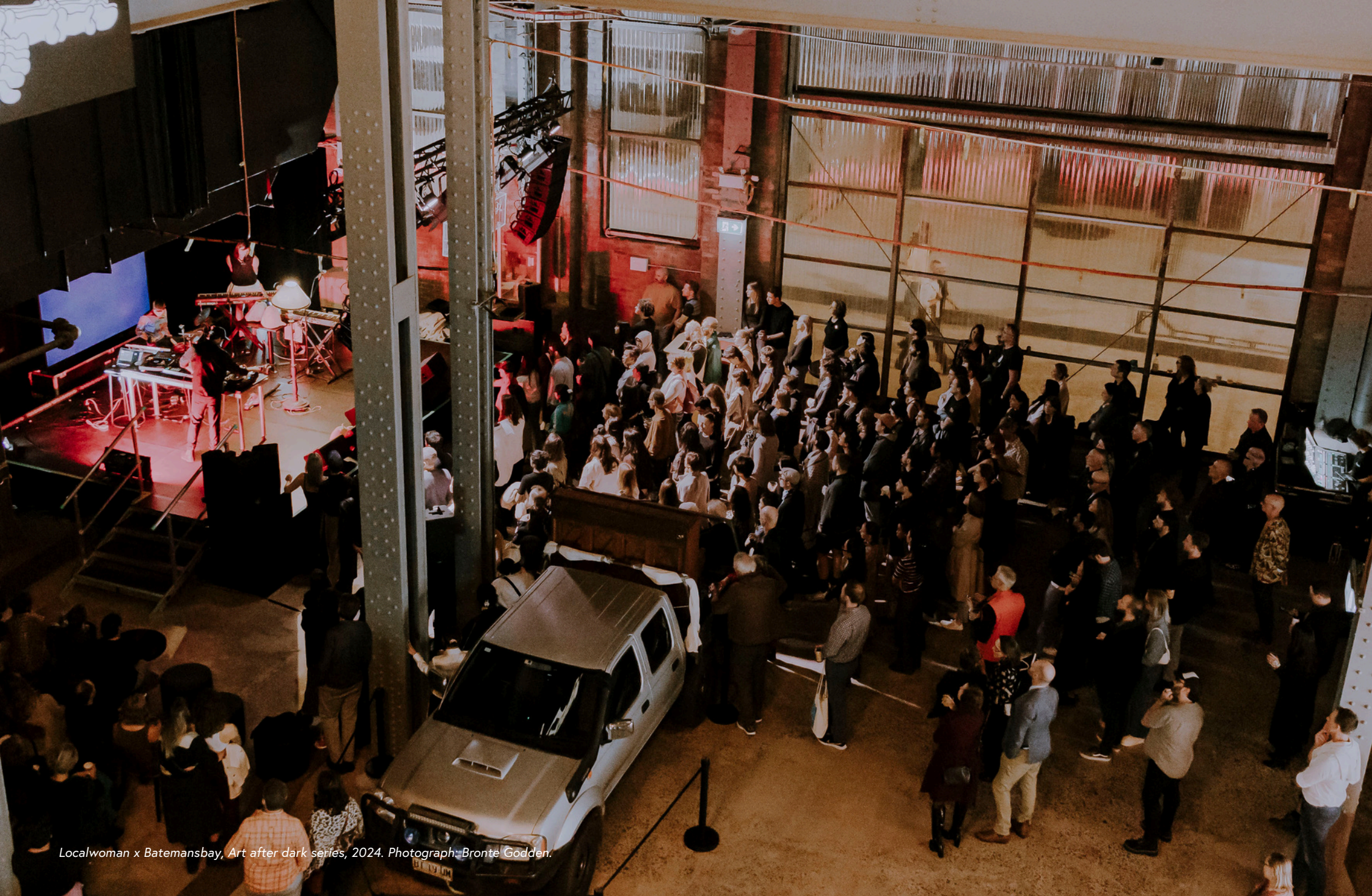
Localwoman x Batemansbay, Art after dark series, 2024.