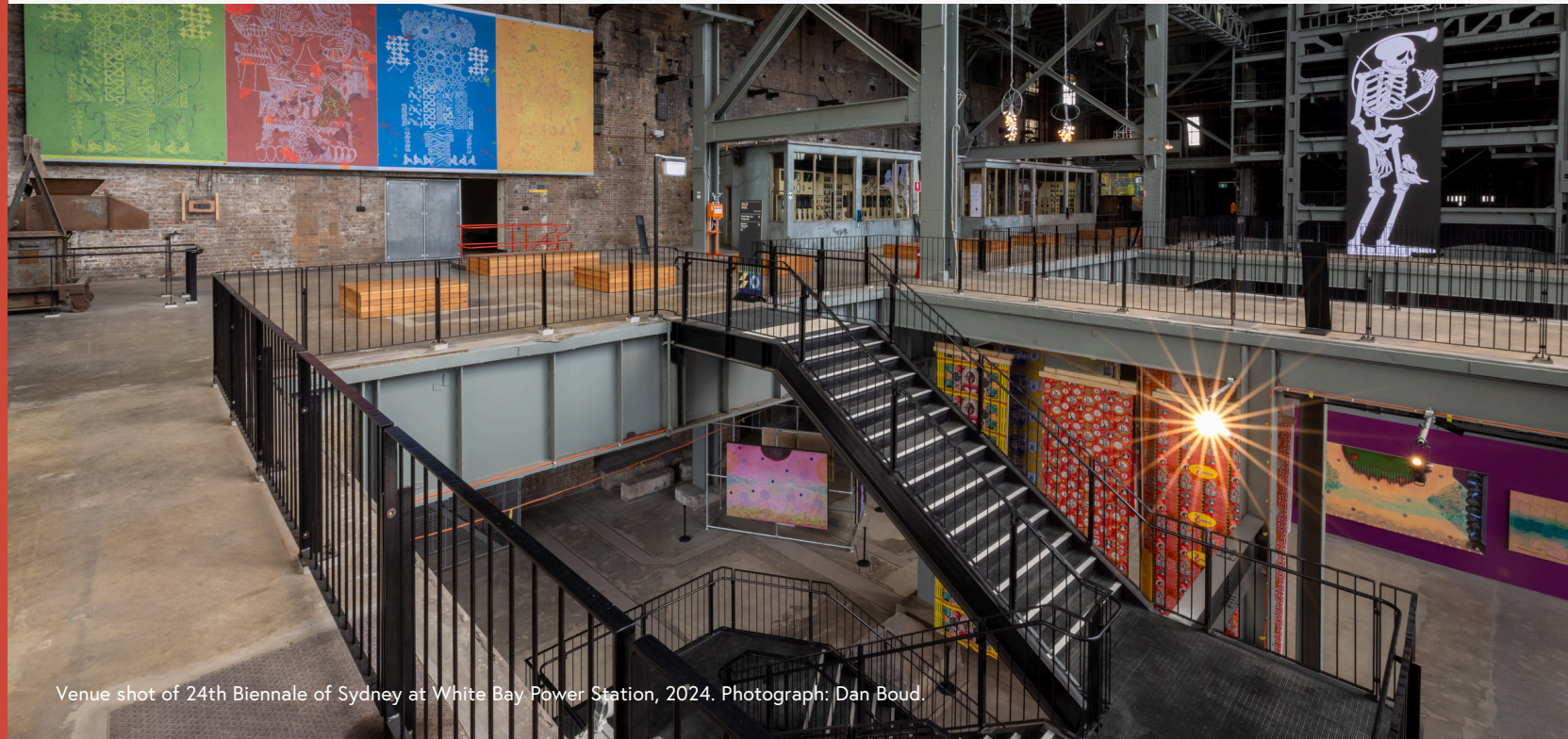
Venue shot of 24th Biennale of Sydney at White Bay Power Station, 2024.

Bring your event to life at White Bay Power Station with the Biennale of Sydney.