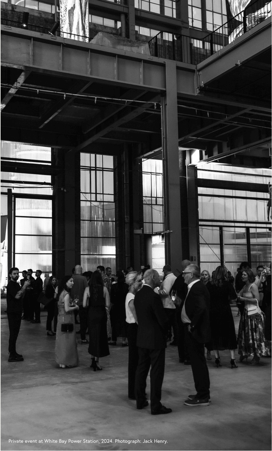
Private event at White Bay Power Station, 2024.

*Exclusive hire of the entire venue. All packages and guest numbers can be tailored to suit your event needs. All prices are ex GST.