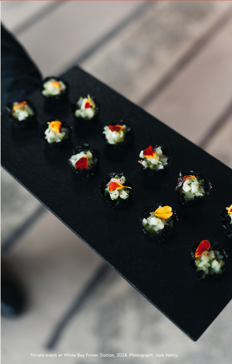
Private event at White Bay Power Station, 2024.