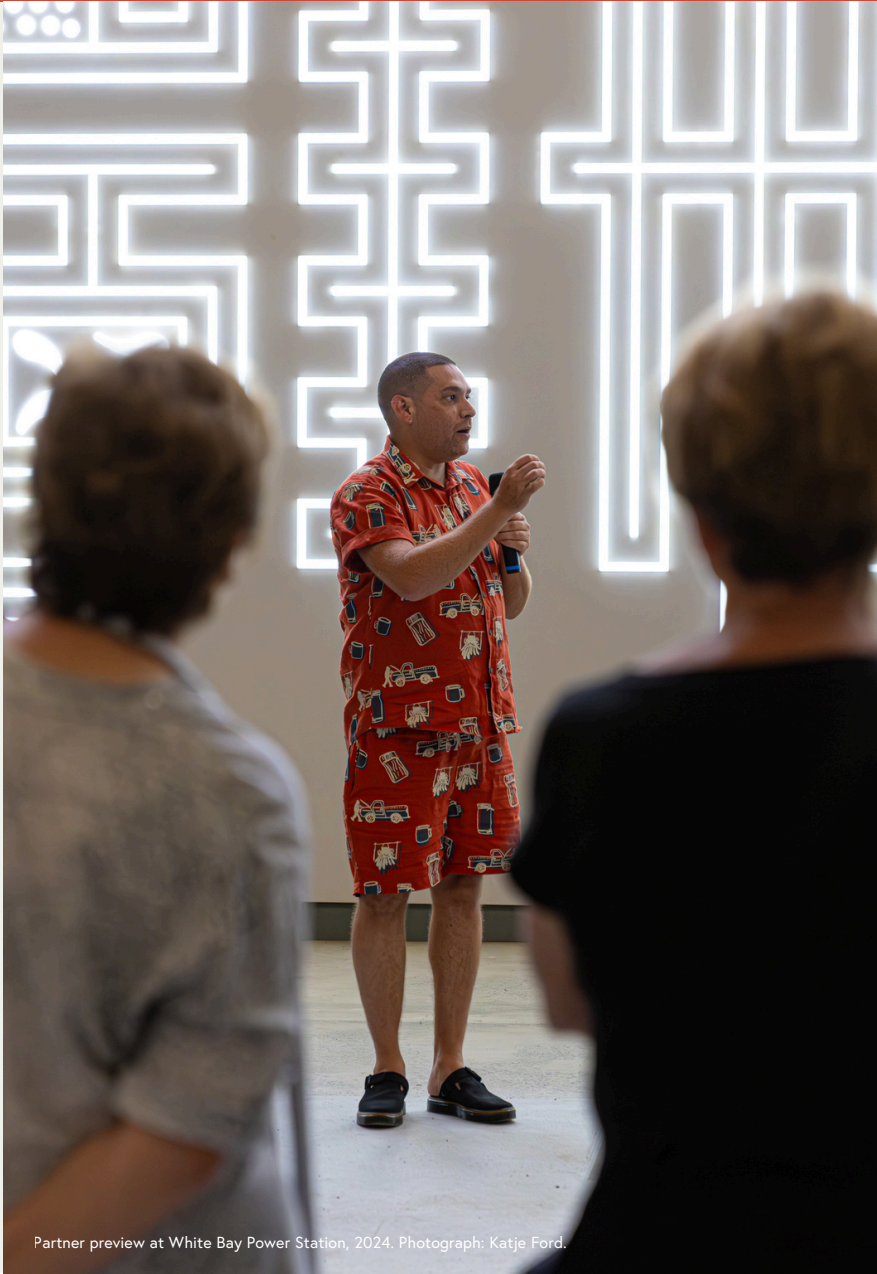
Partner preview at White Bay Power Station, 2024.

*All packages and guest numbers can be tailored to suit your event needs. All prices are ex GST.