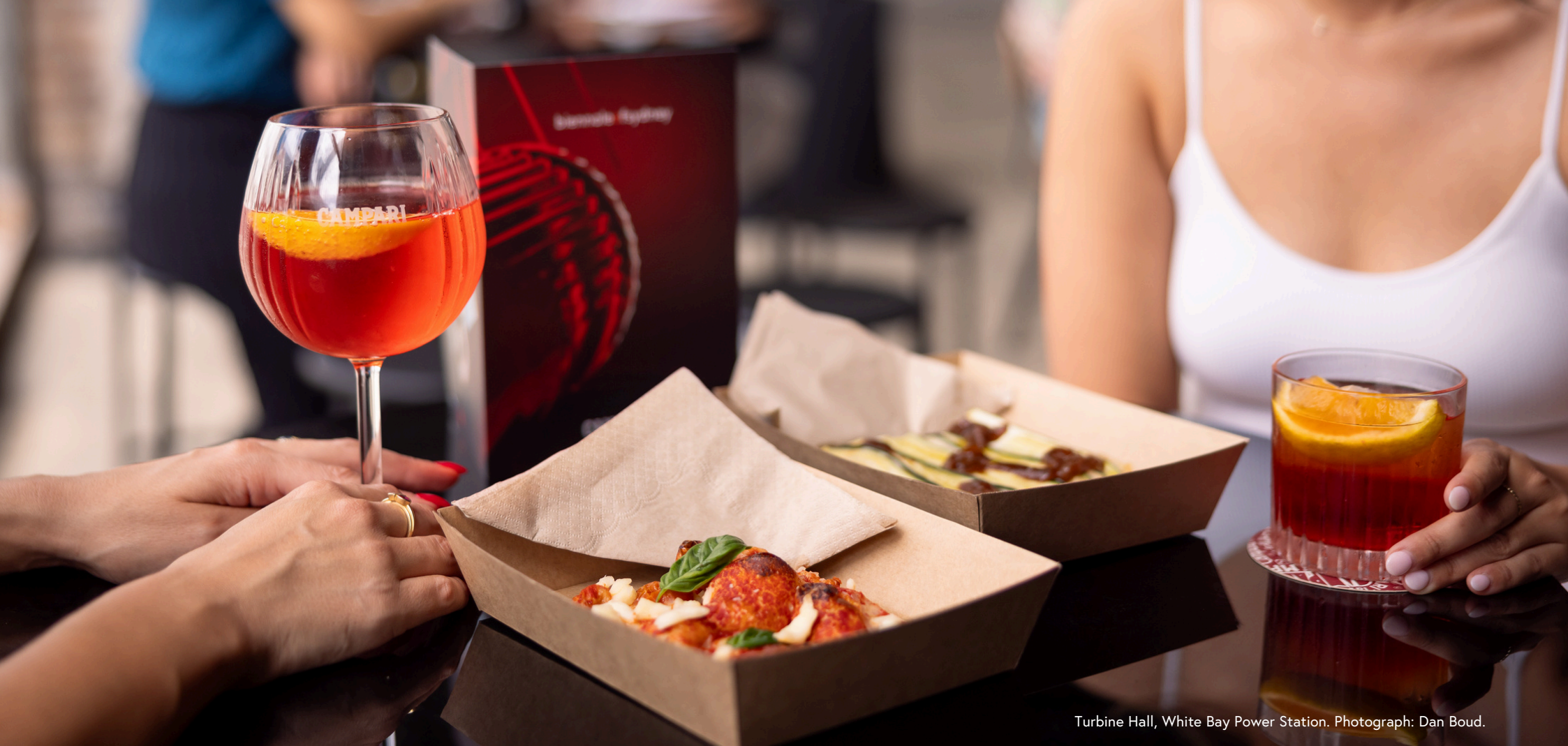
Turbine Hall, White Bay Power Station.