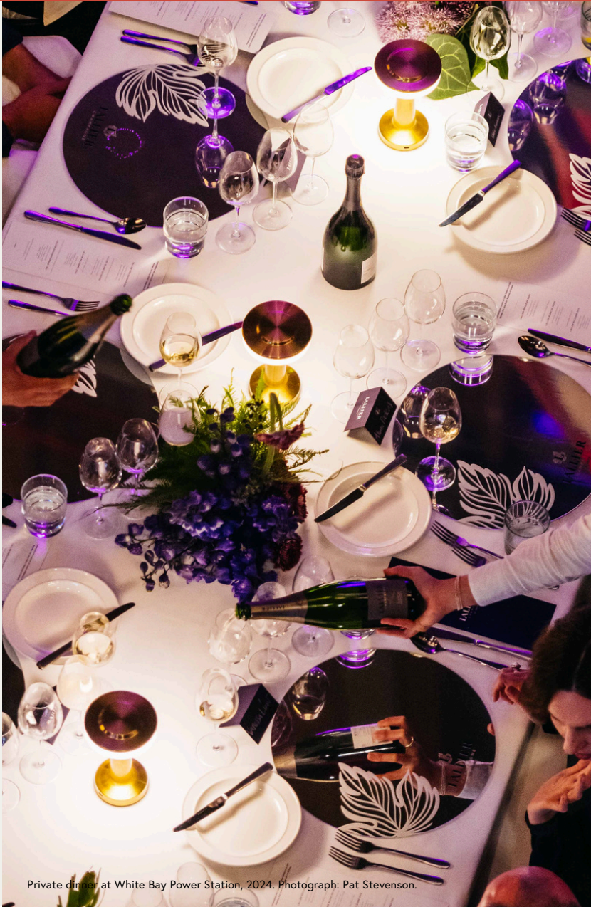
Private dinner at White Bay Power Station, 2024.