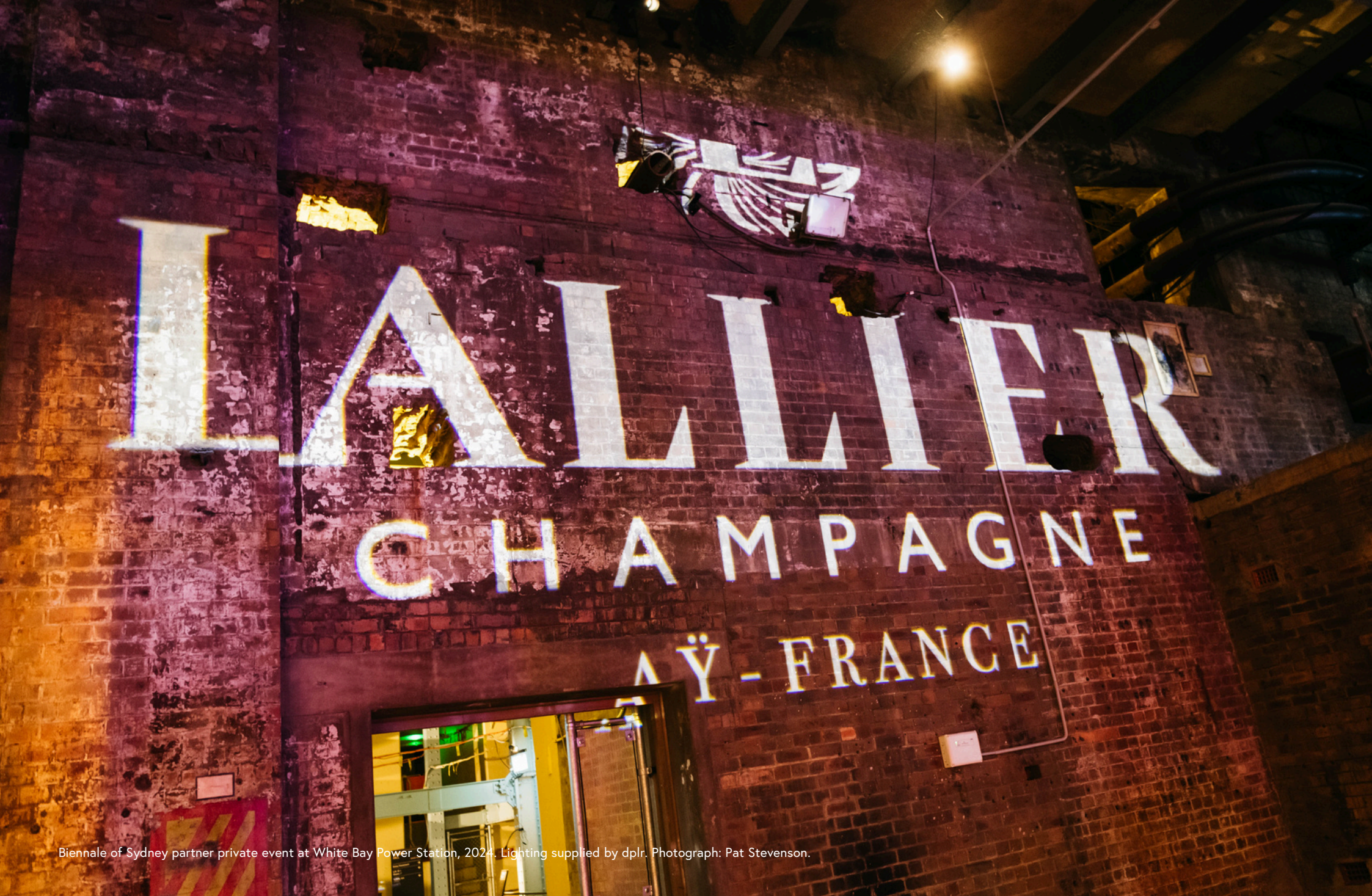
Biennale of Sydney partner private event at White Bay Power Station, 2024. Lighting supplied by dplr.