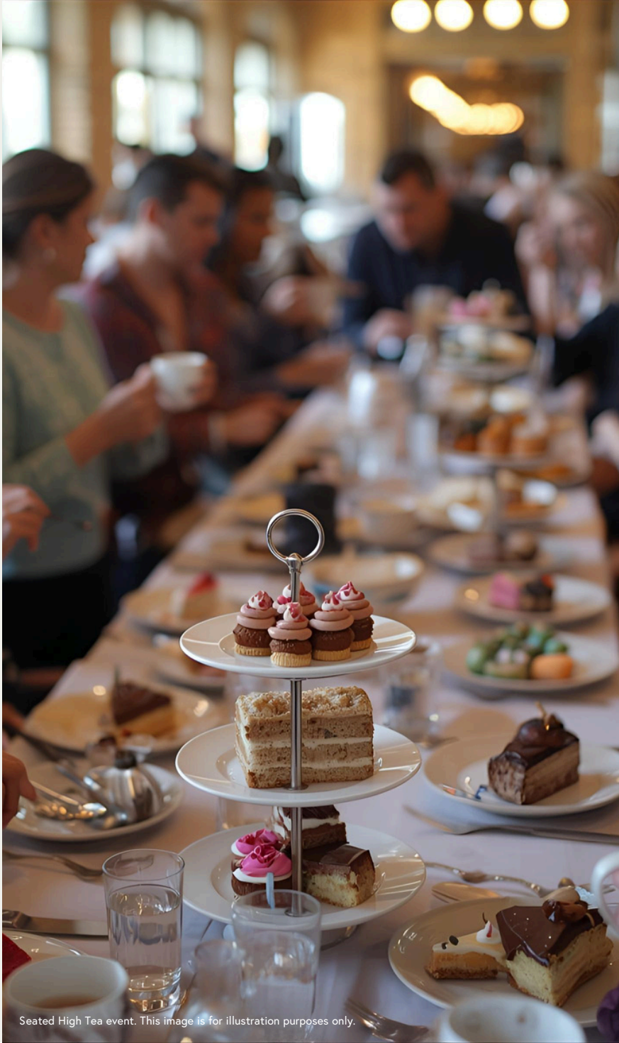
Seated High Tea event. This image is for illustration purposes only.

*All packages and guest numbers can be tailored to suit your event needs. All prices are ex GST.