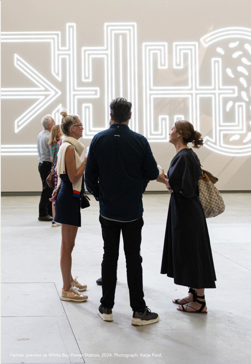
Partner preview at White Bay Power Station, 2024.