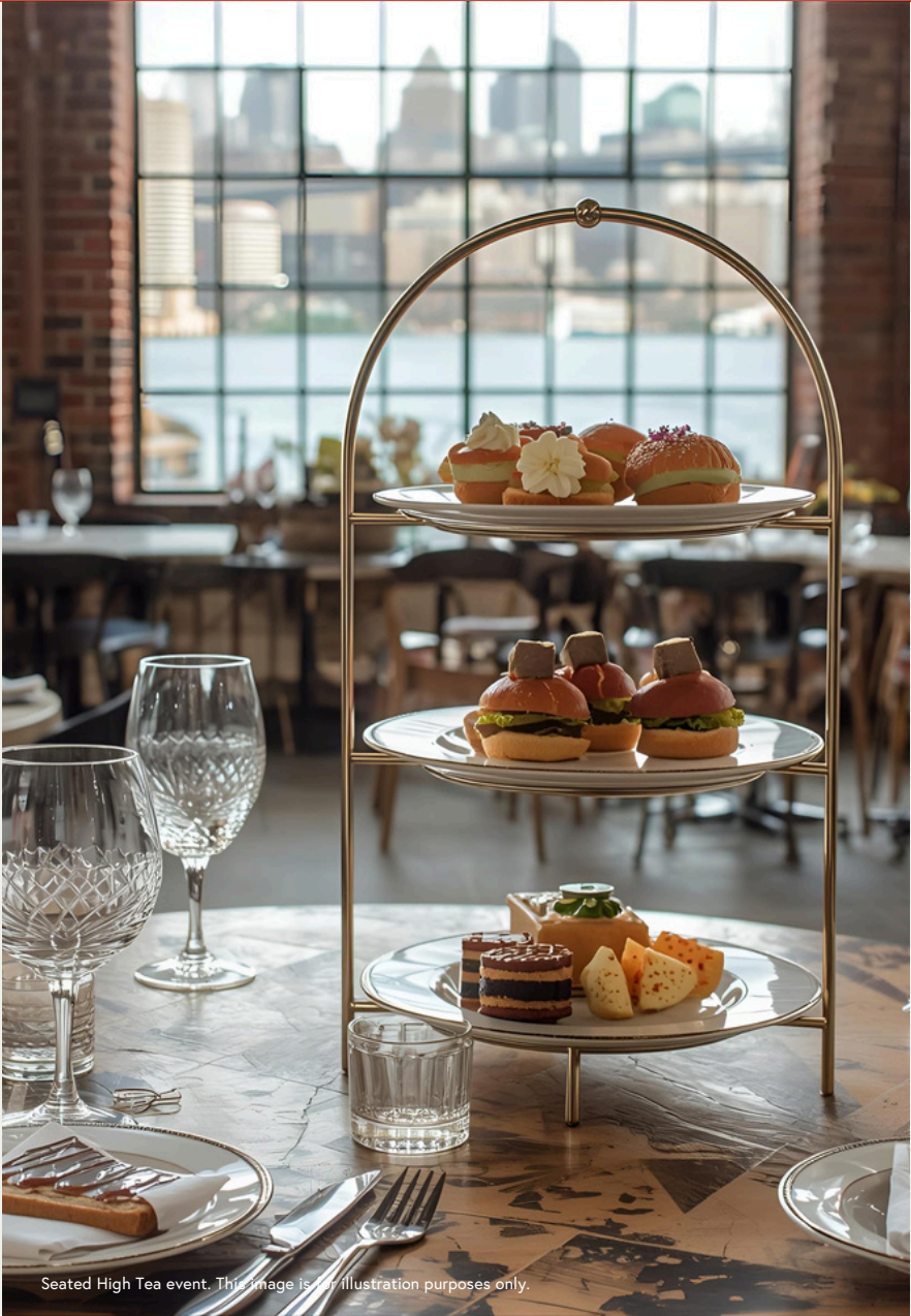
Seated High Tea event. This image is for illustration purposes only.