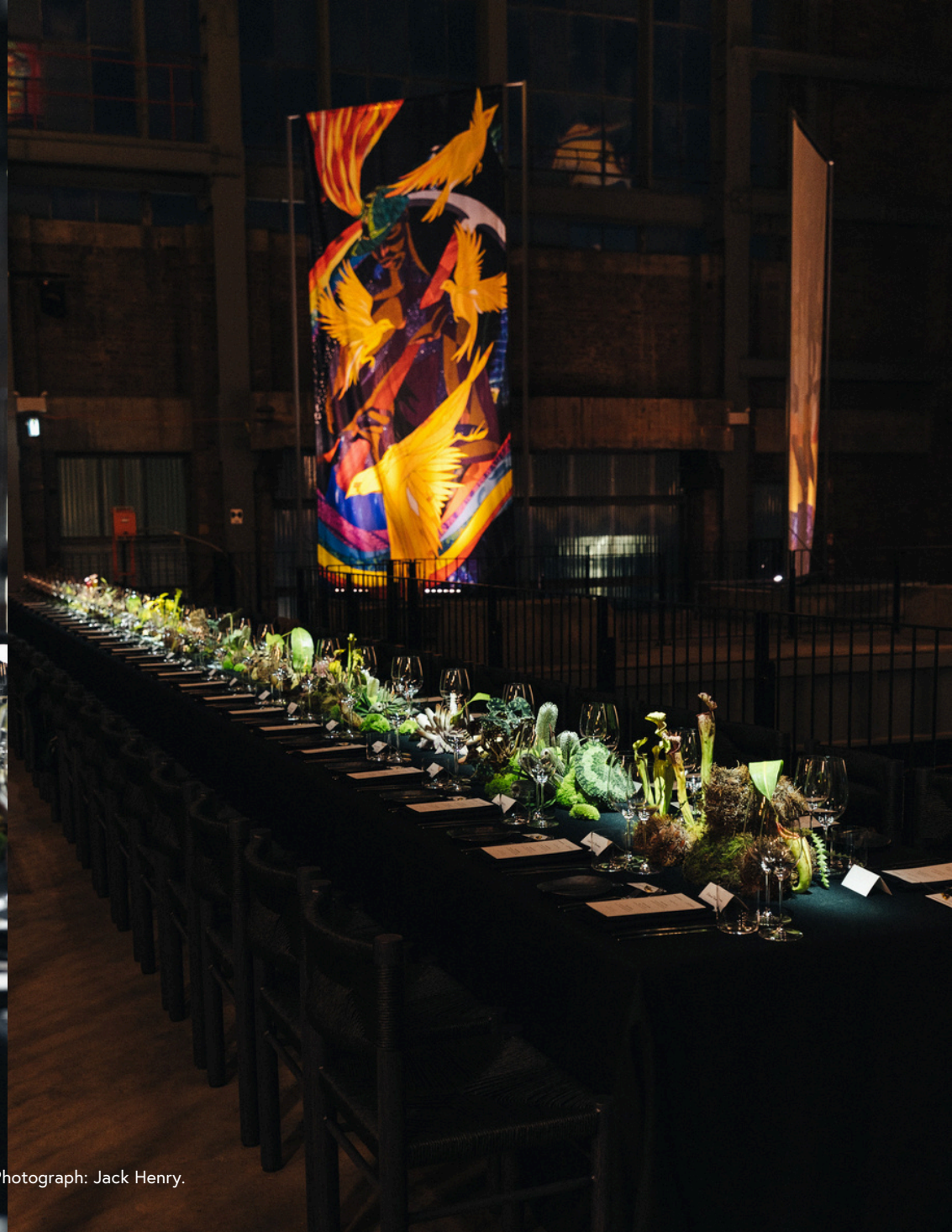
Biennale of Sydney Partner's private event produced by Cook & Waiter at White Bay Power Station, 2024.