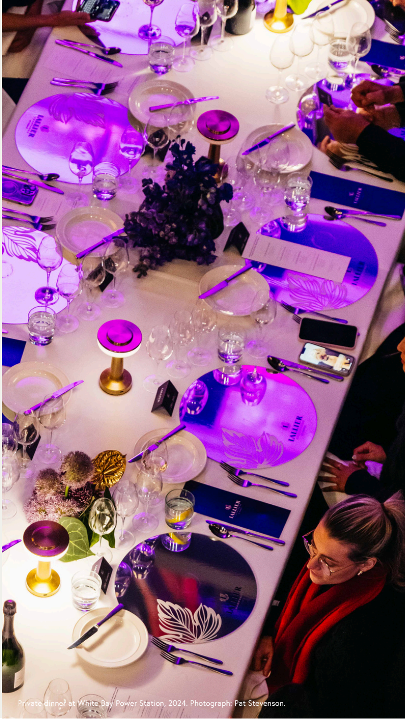
Private dinner at White Bay Power Station, 2024.

*Exclusive hire of the entire venue. All packages and guest numbers can be tailored to suit your event needs. All prices are ex GST.