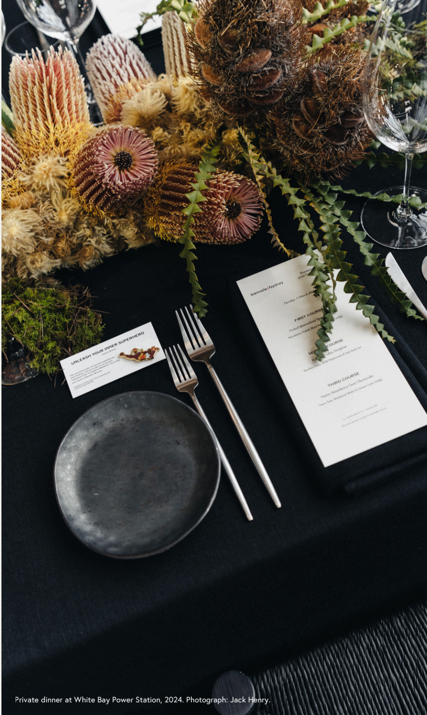
Private dinner at White Bay Power Station, 2024.

*Exclusive hire of the entire venue. All packages and guest numbers can be tailored to suit your event needs. All prices are ex GST.