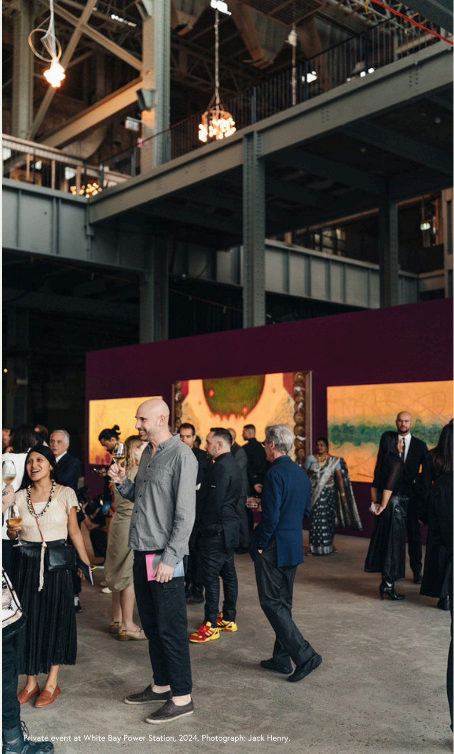
Private event at White Bay Power Station, 2024.

*All packages and guest numbers can be tailored to suit your event needs. All prices are ex GST.