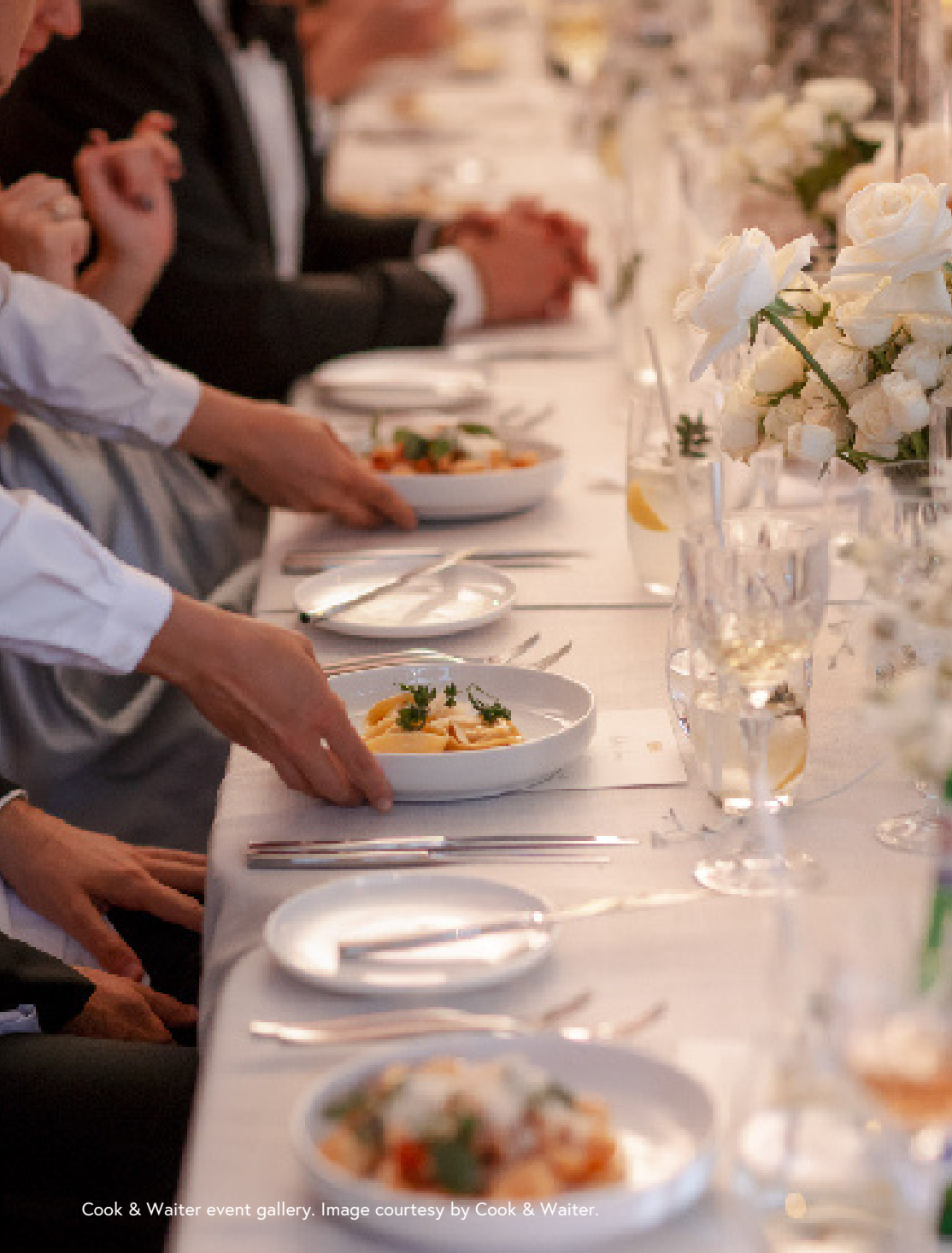
Cook & Waiter event gallery.