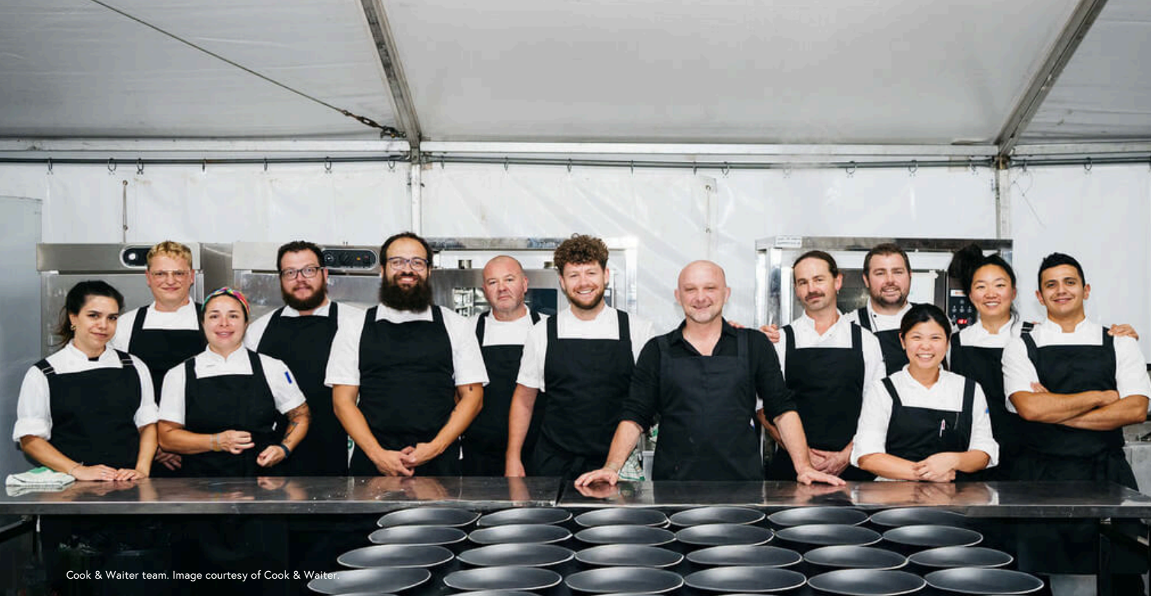
Cook & Waiter team.

COOK & WAITER Food, Beverage & Furniture