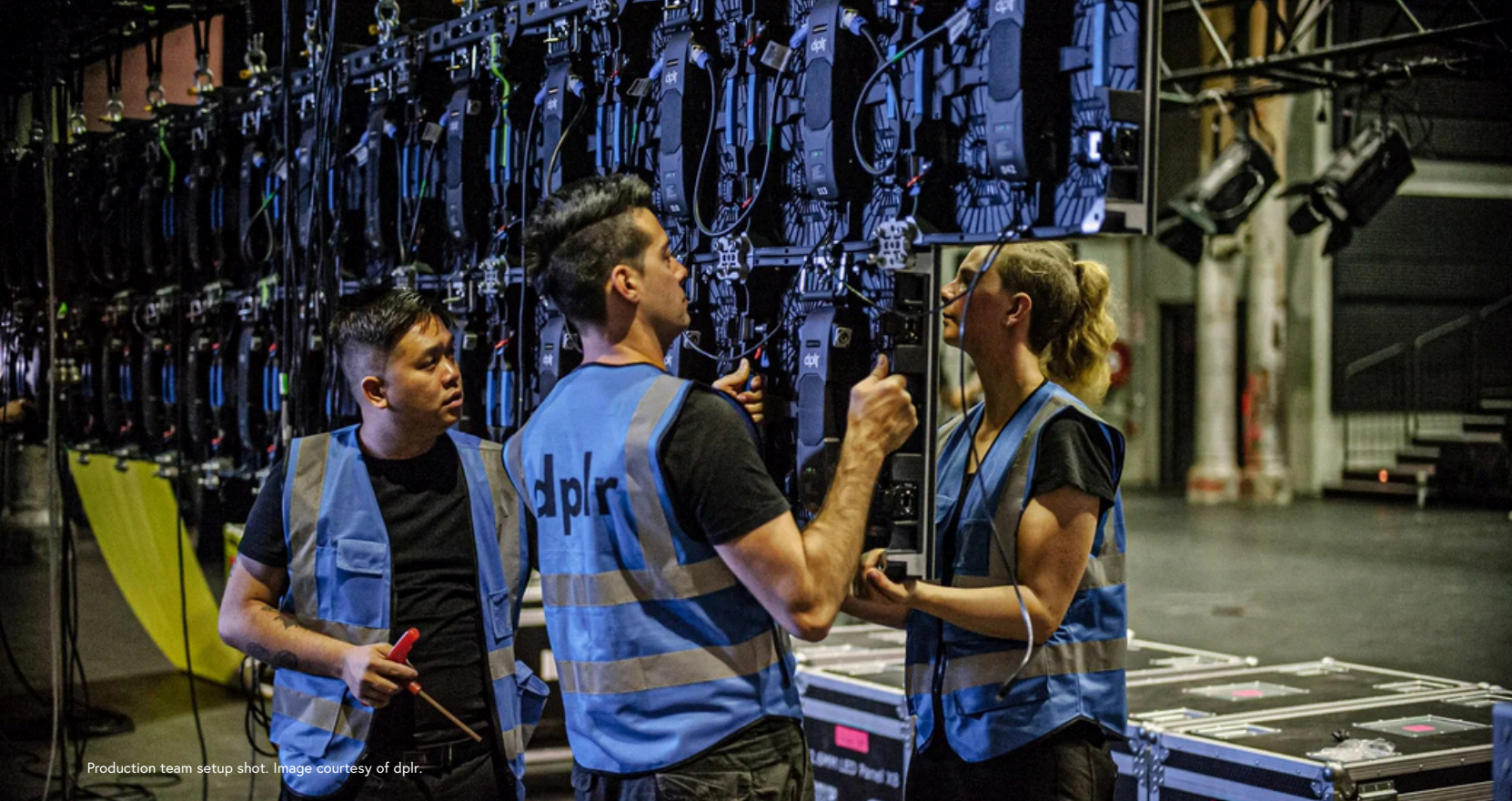
Production team setup shot.