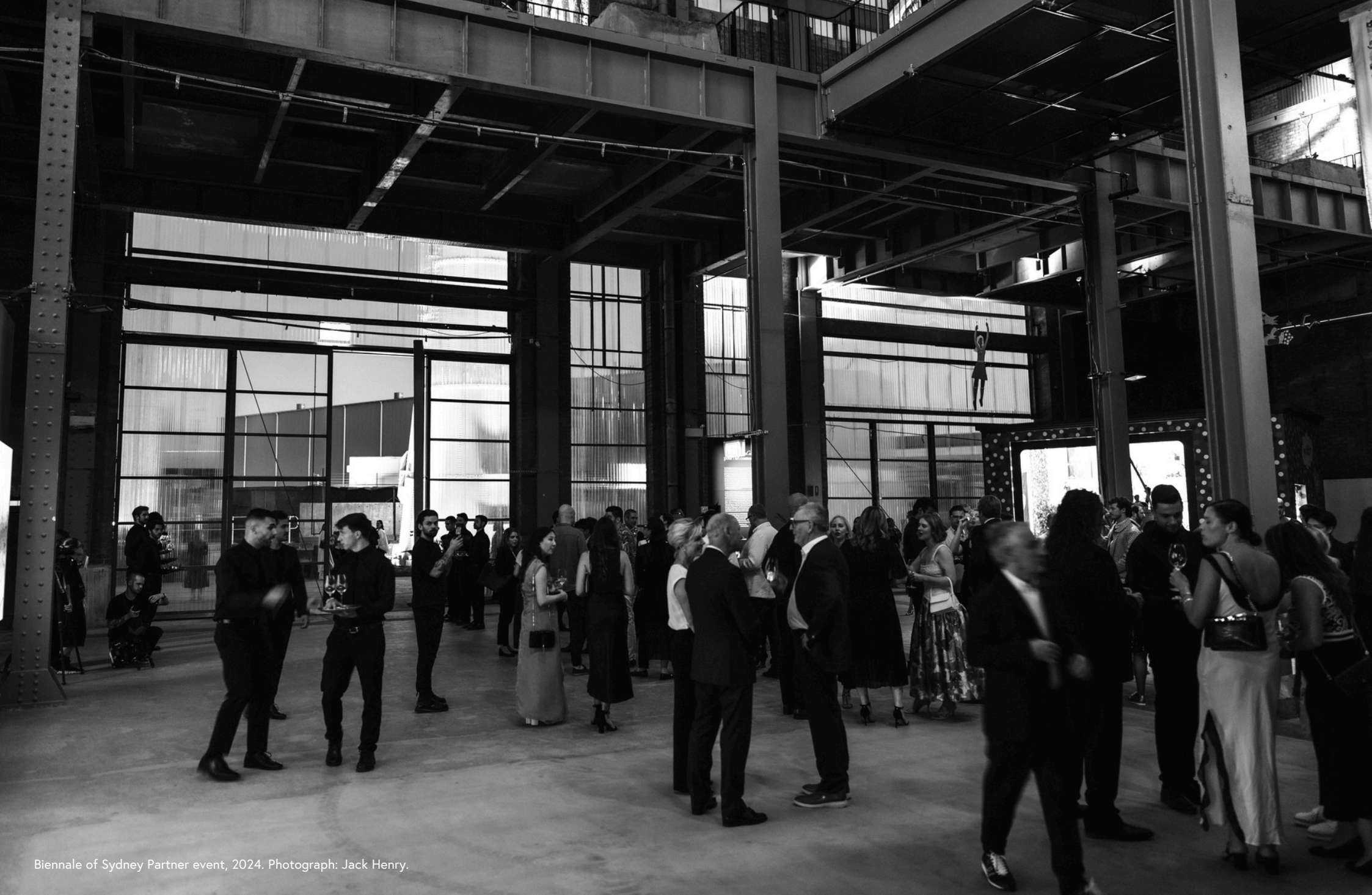
Biennale of Sydney Partner event, 2024.