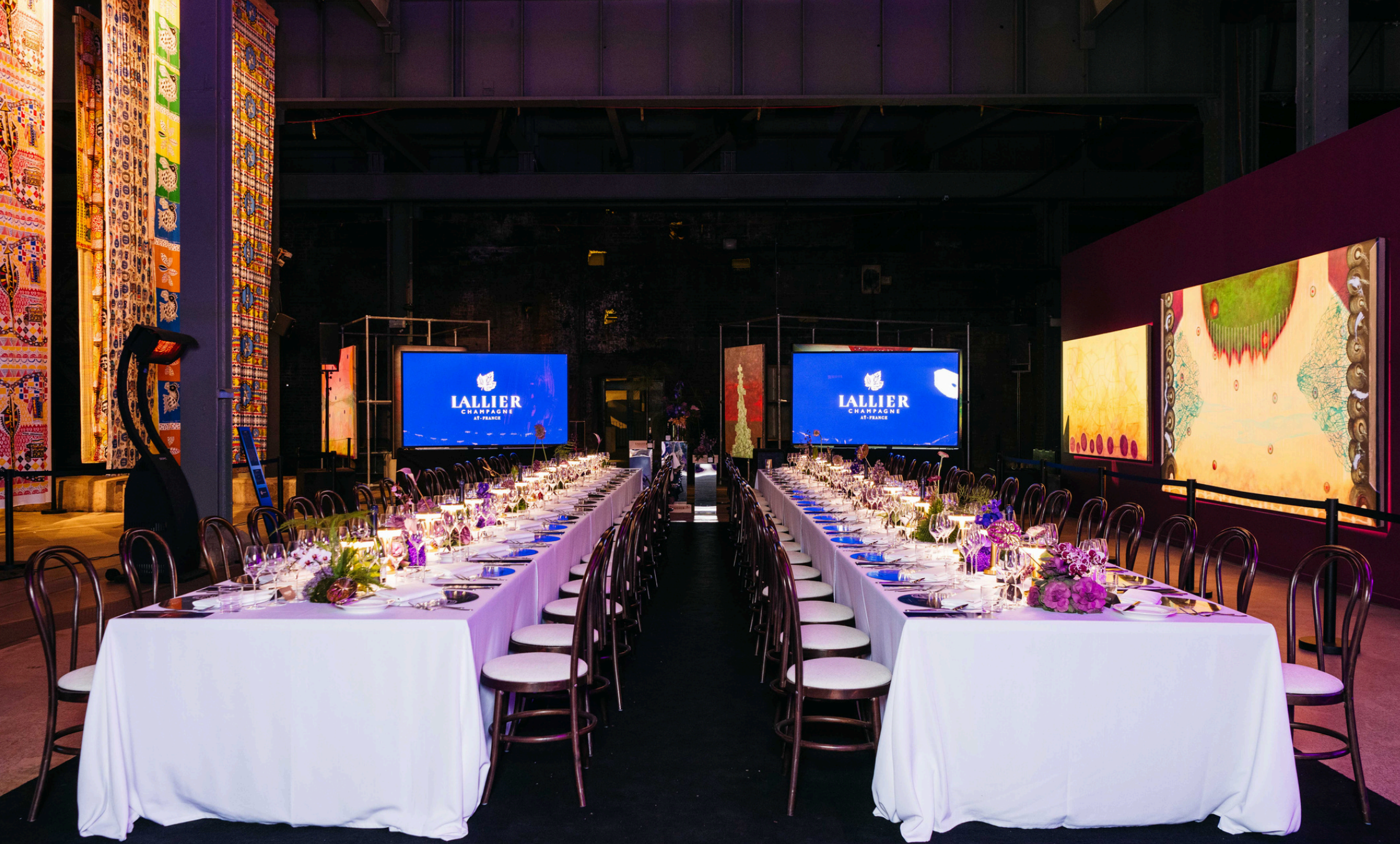
Private Event at White Bay Power Station during 24th Biennale of Sydney, 2024.