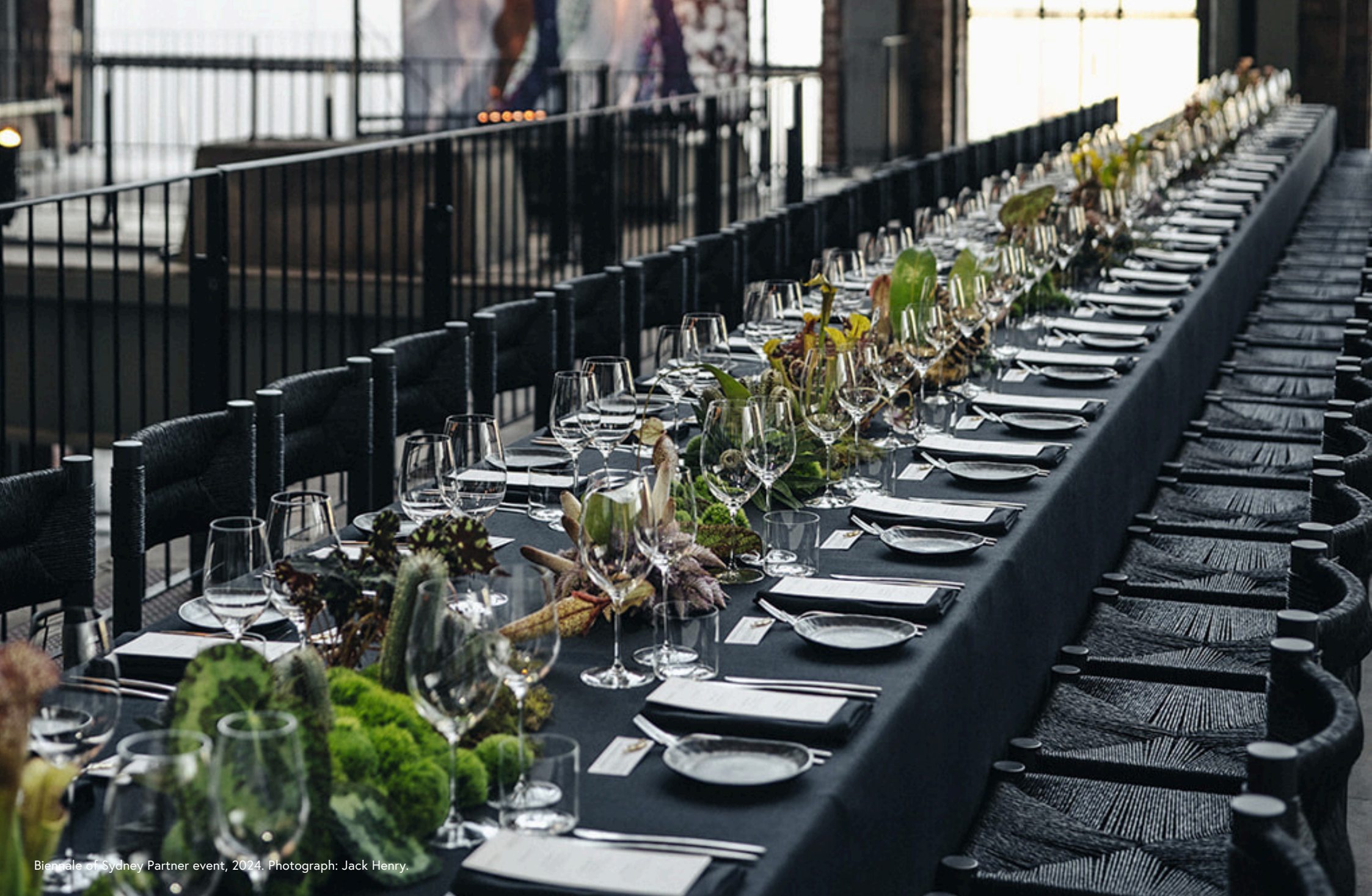
Biennale of Sydney Partner event, 2024.