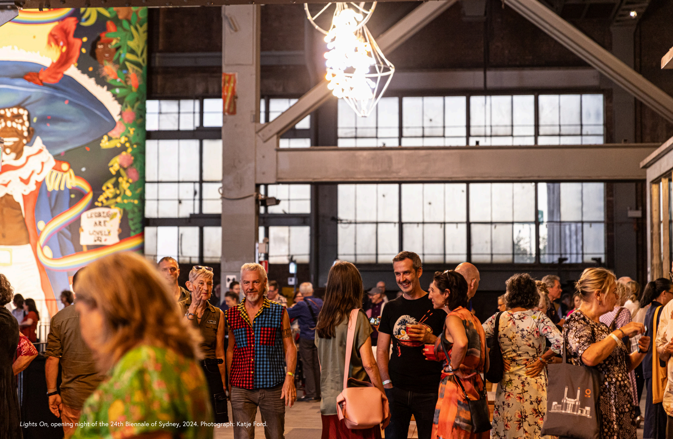
Lights On , opening night of the 24th Biennale of Sydney, 2024.