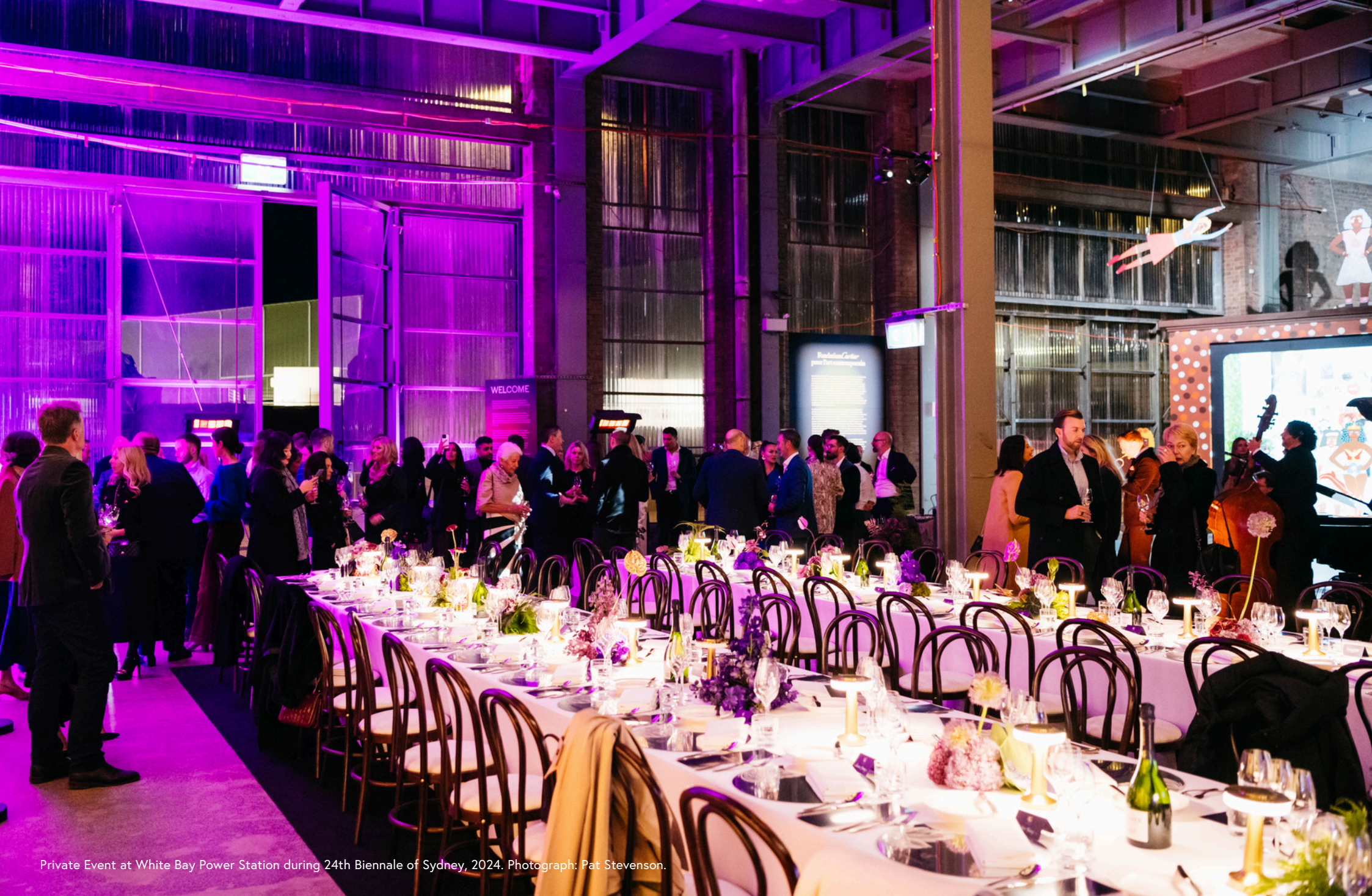
Private Event at White Bay Power Station during 24th Biennale of Sydney, 2024.