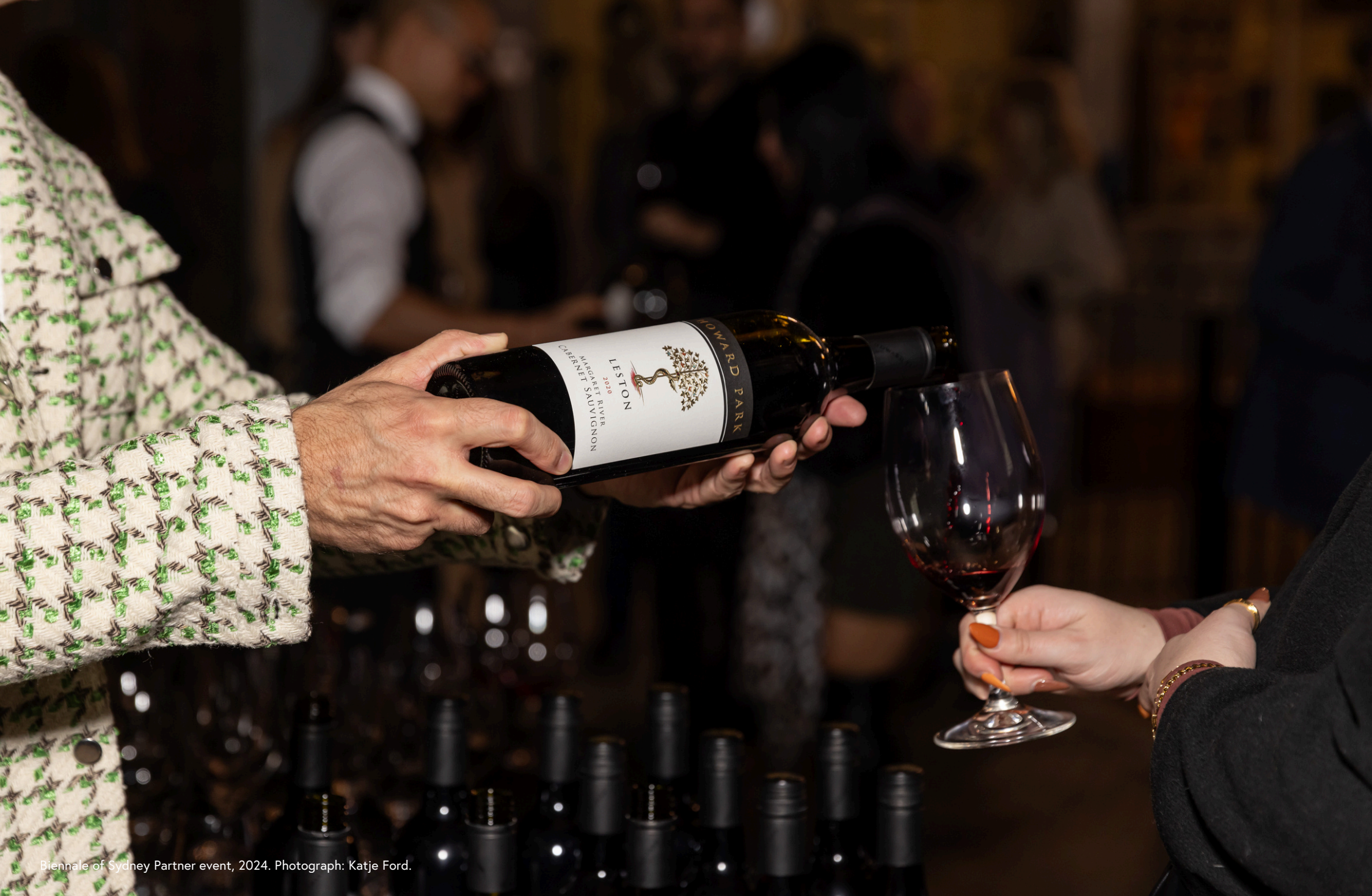
Biennale of Sydney Partner event, 2024.