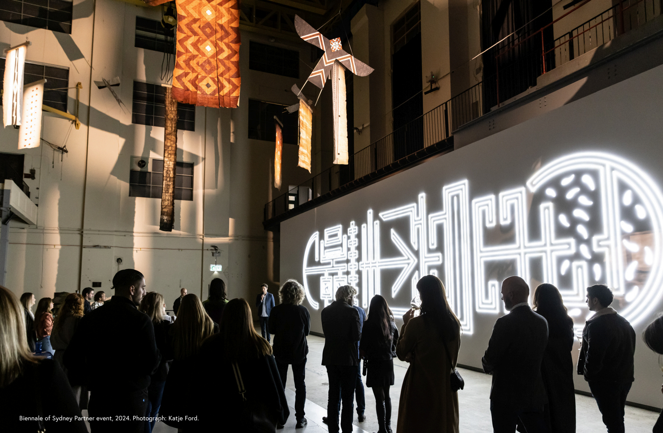
Biennale of Sydney Partner event, 2024.