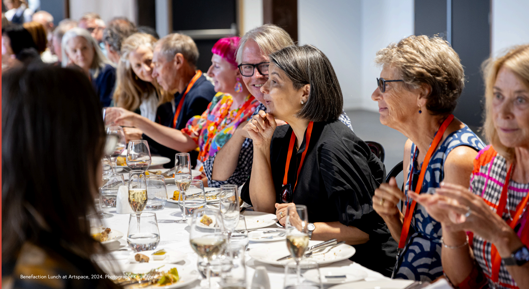
Benefaction Lunch at Artspace, 2024.

Biennale Breakfast Biennale Dinner Biennale Social Art & Wine Tour High Tea