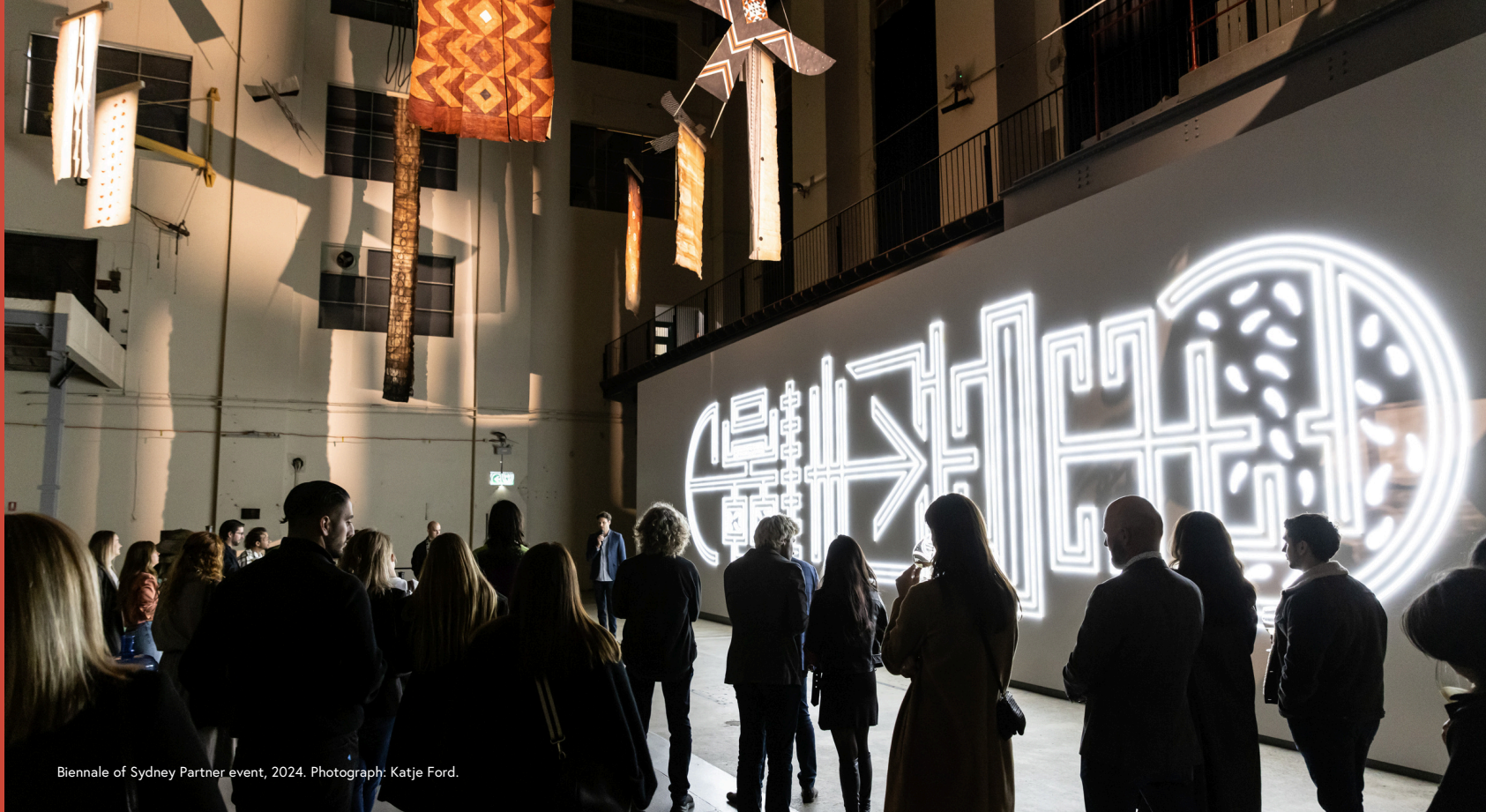
Biennale of Sydney Partner event, 2024.

Biennale Breakfast Biennale Dinner Biennale Social Art & Wine Tour High Tea