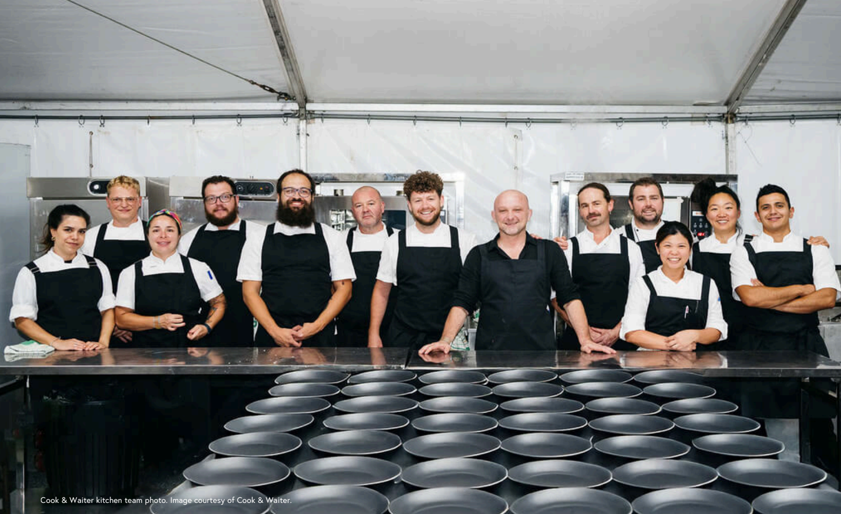
Cook & Waiter kitchen team photo.