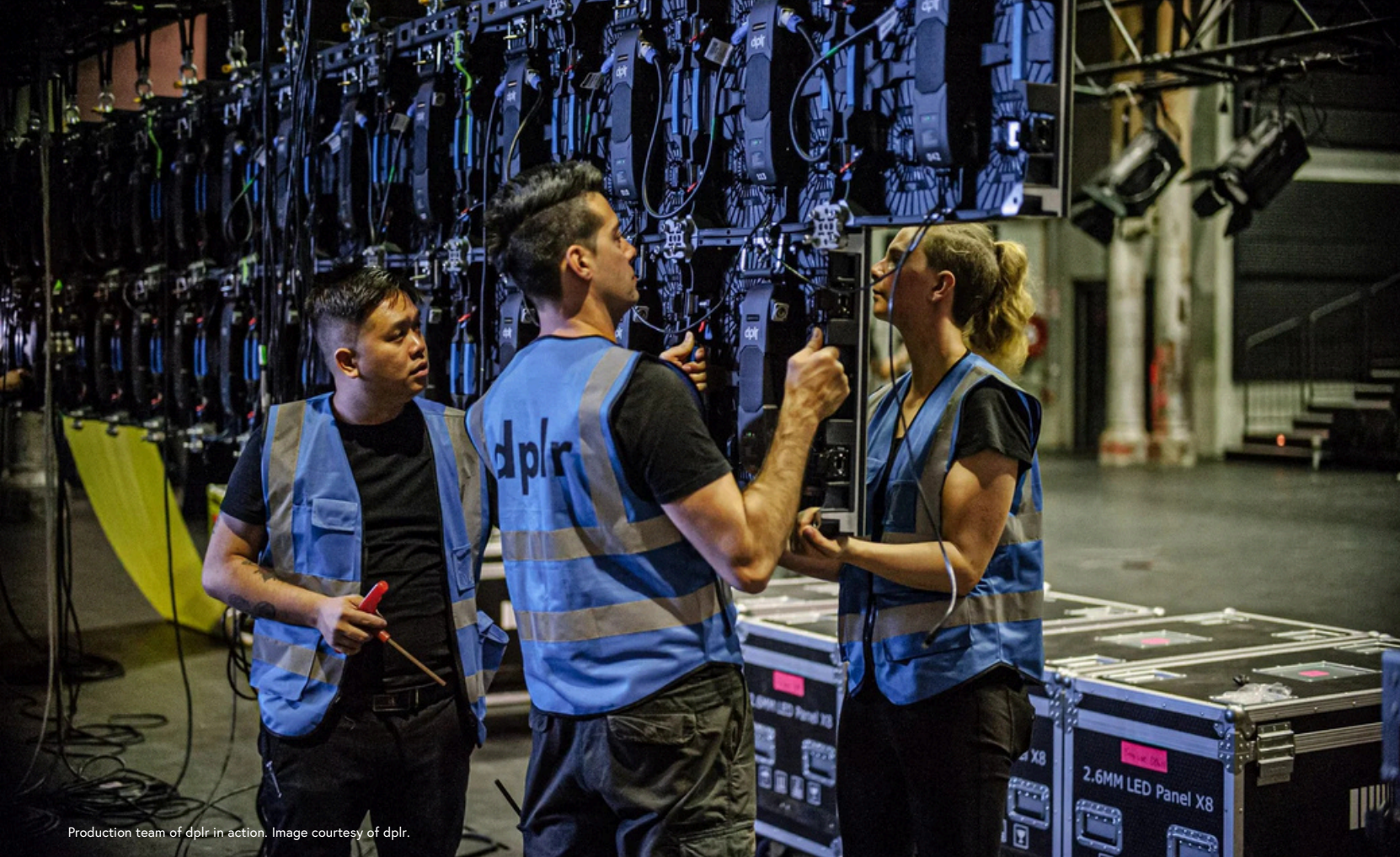
Production team of dplr in action.