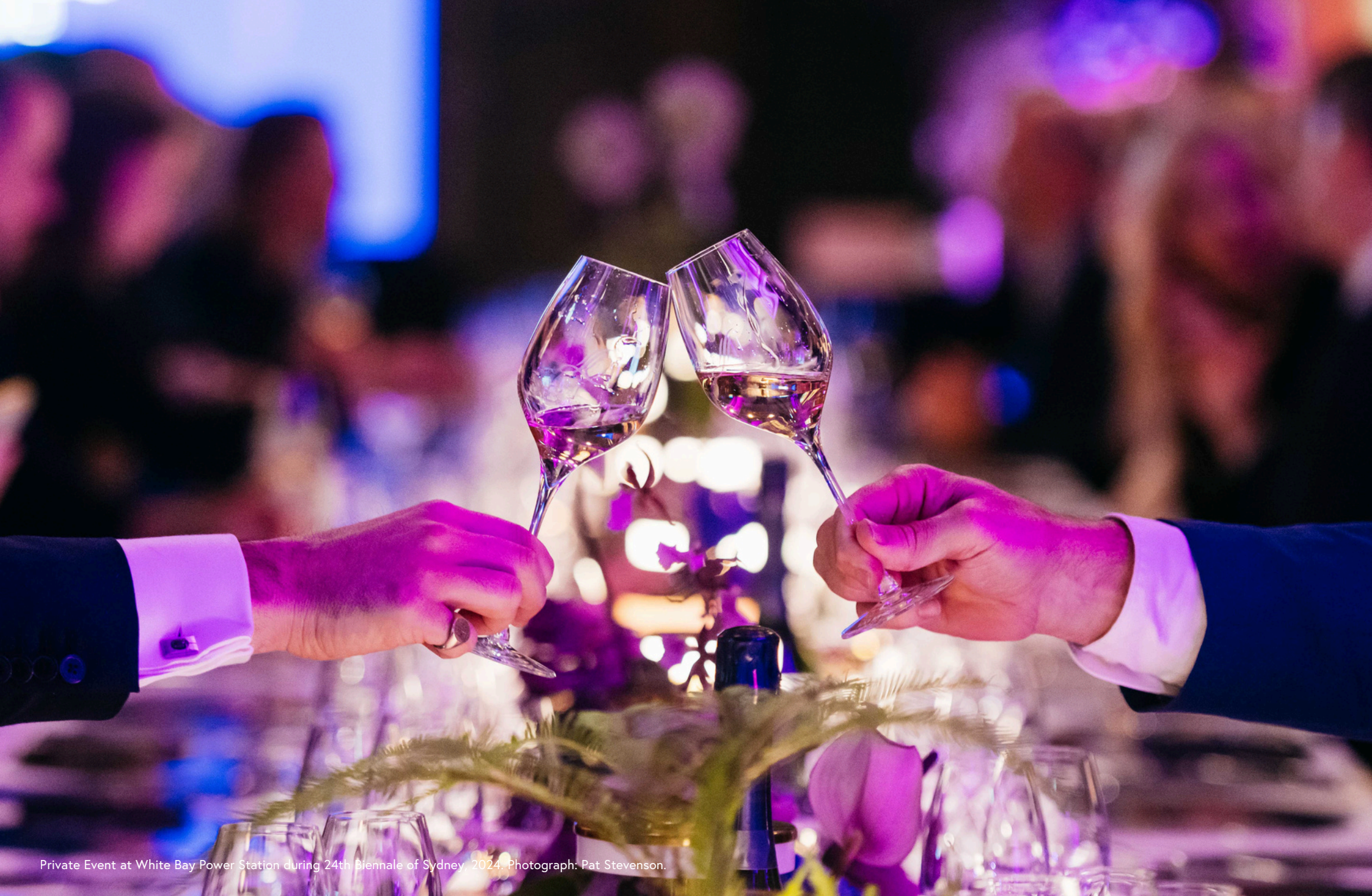
Private Event at White Bay Power Station during 24th Biennale of Sydney, 2024.