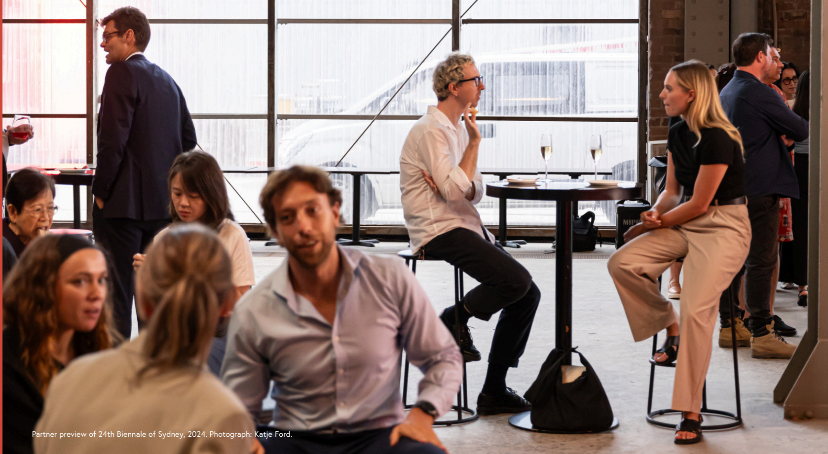
Partner preview of 24th Biennale of Sydney, 2024.

A vibrant cocktail reception with canapés, sweet treats, and premium wines — perfect for networking or client celebrations.