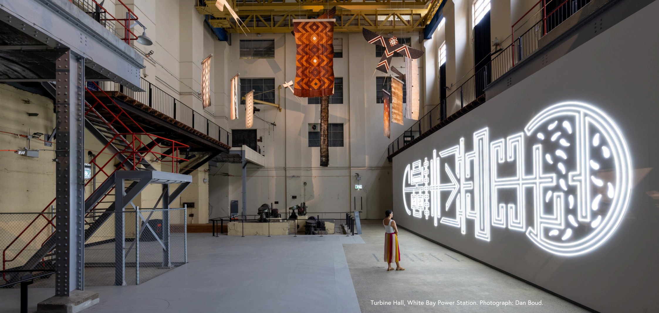
Turbine Hall, White Bay Power Station.