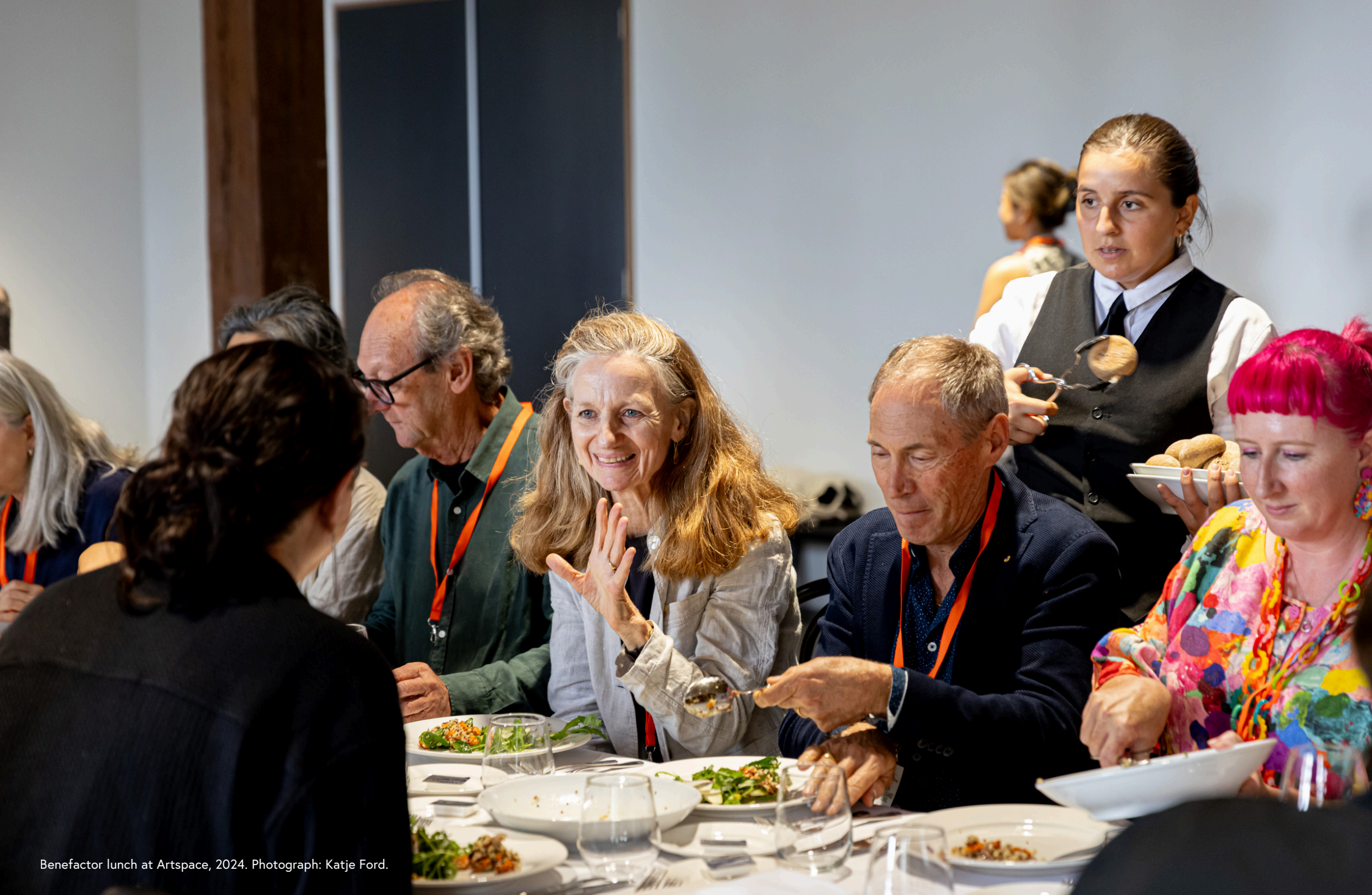
Benefactor lunch at Artspace, 2024.