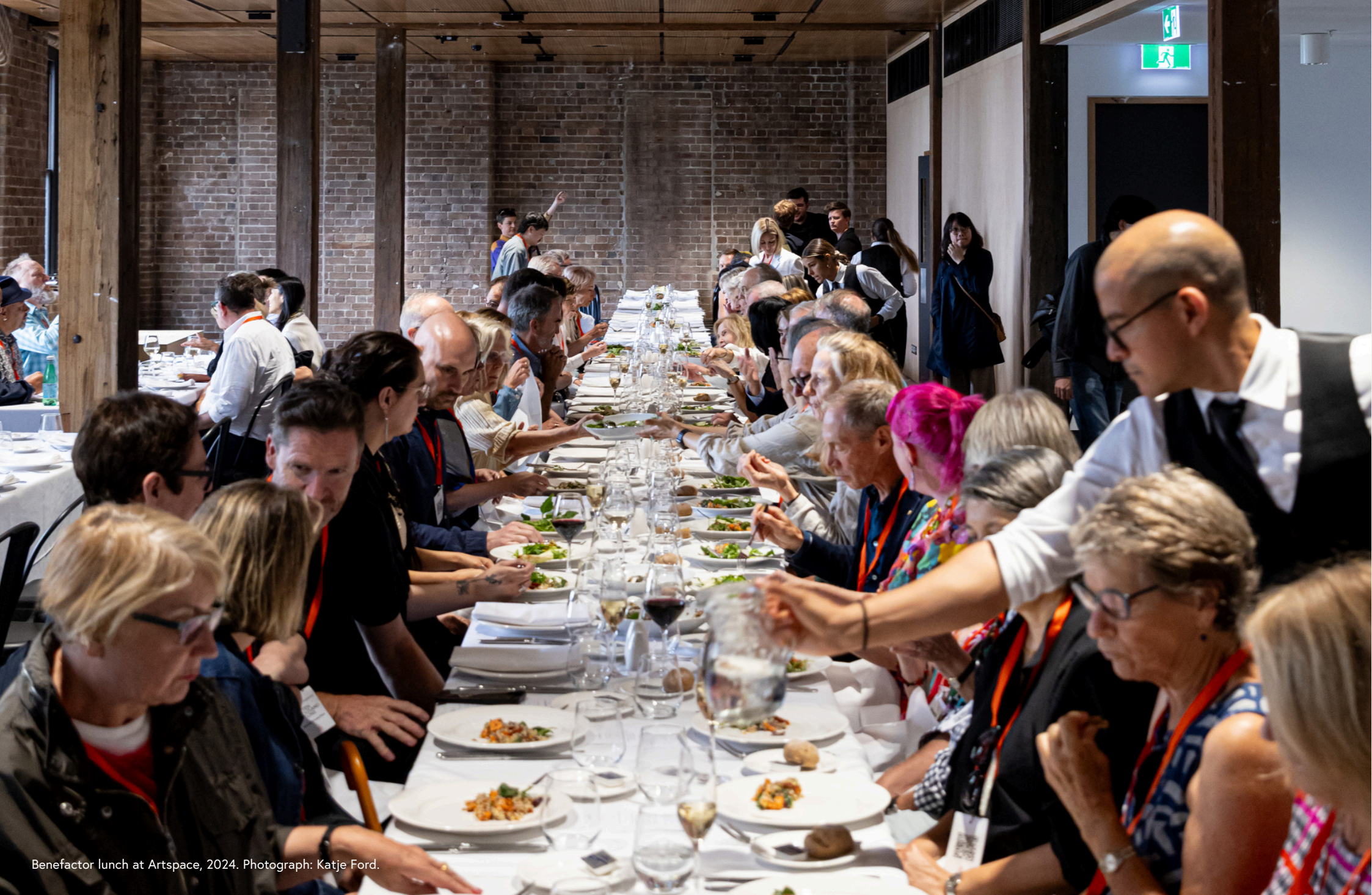
Benefactor lunch at Artspace, 2024.