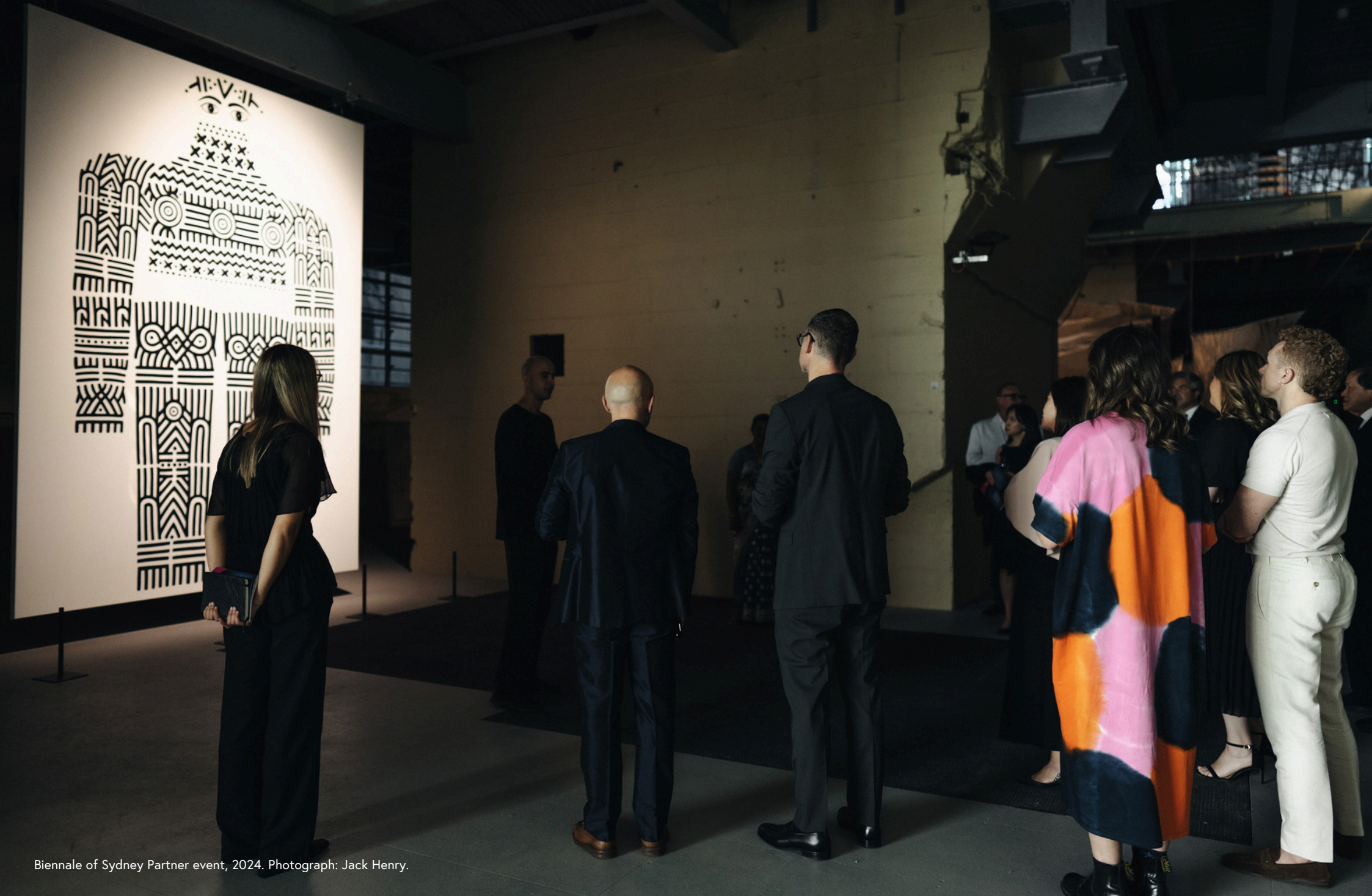
Biennale of Sydney Partner event, 2024.