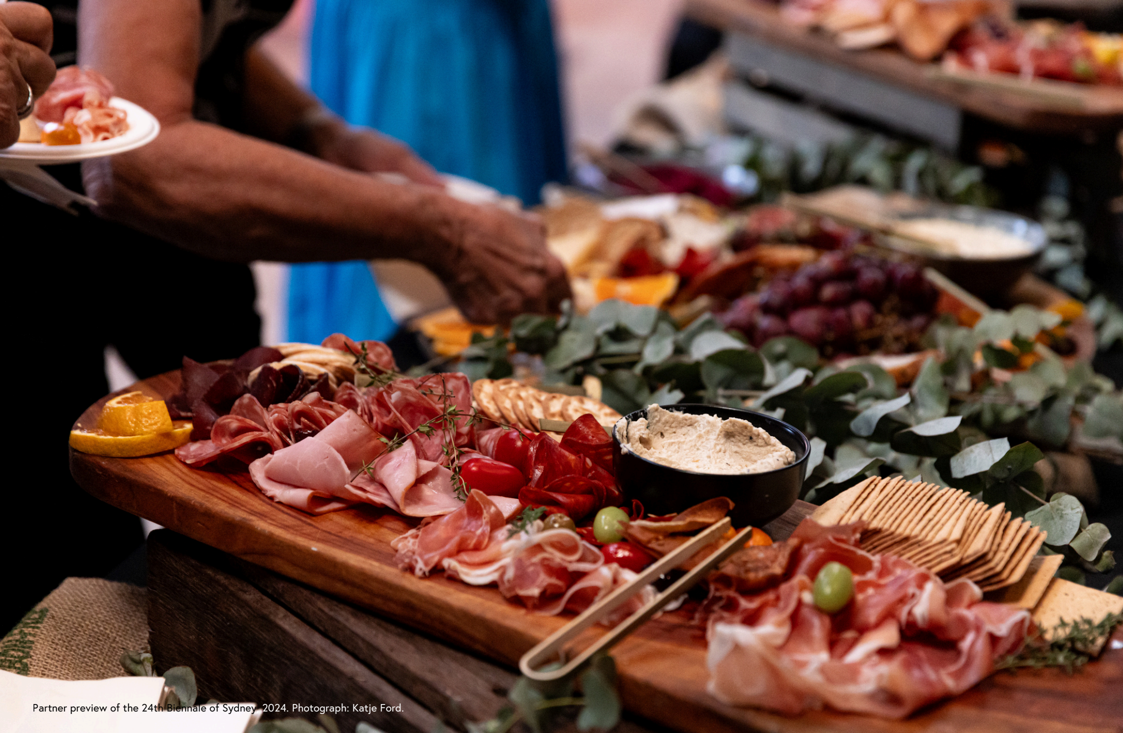
Partner preview of the 24th Biennale of Sydney 2024.