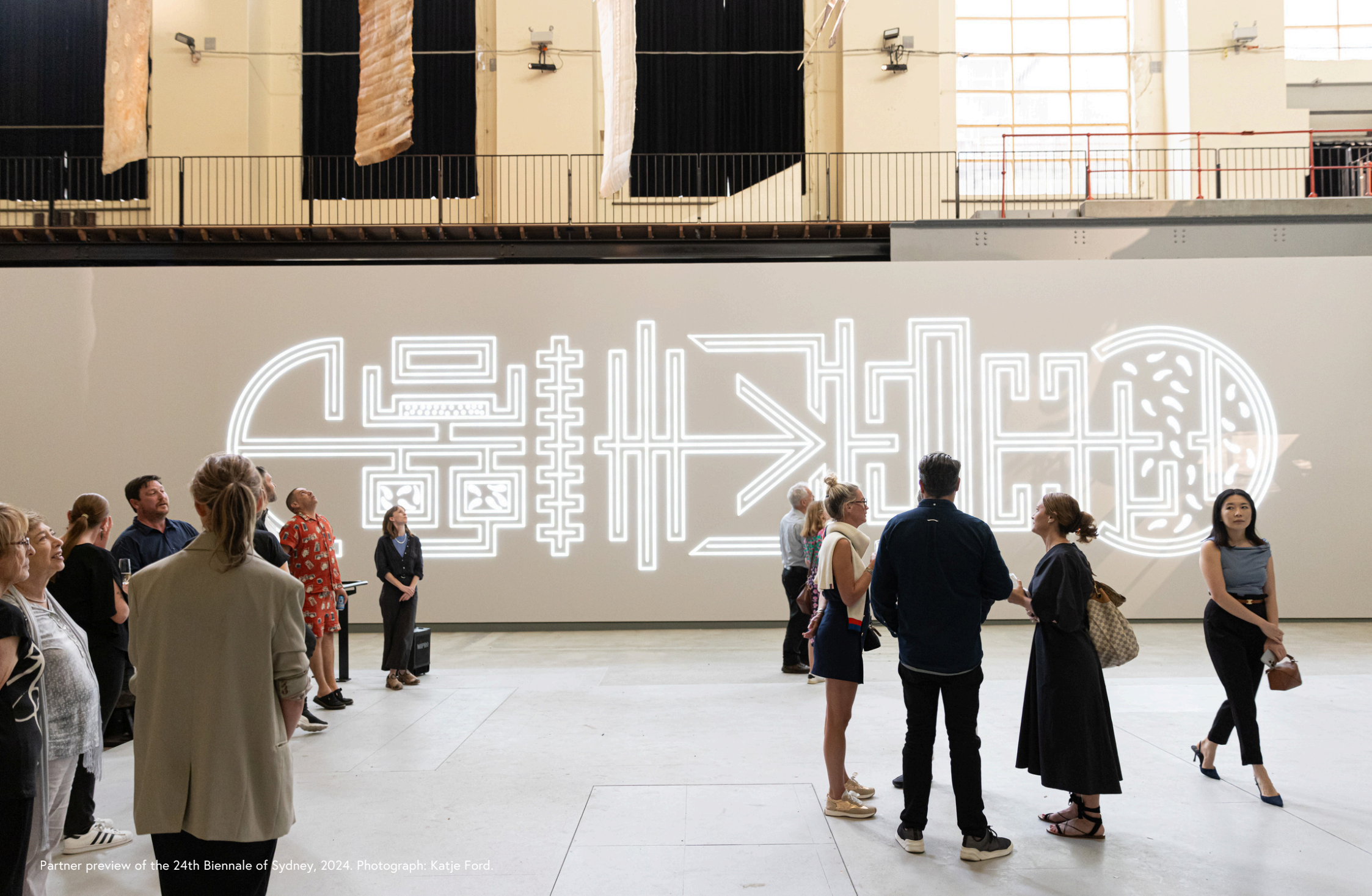
Partner preview of the 24th Biennale of Sydney, 2024.