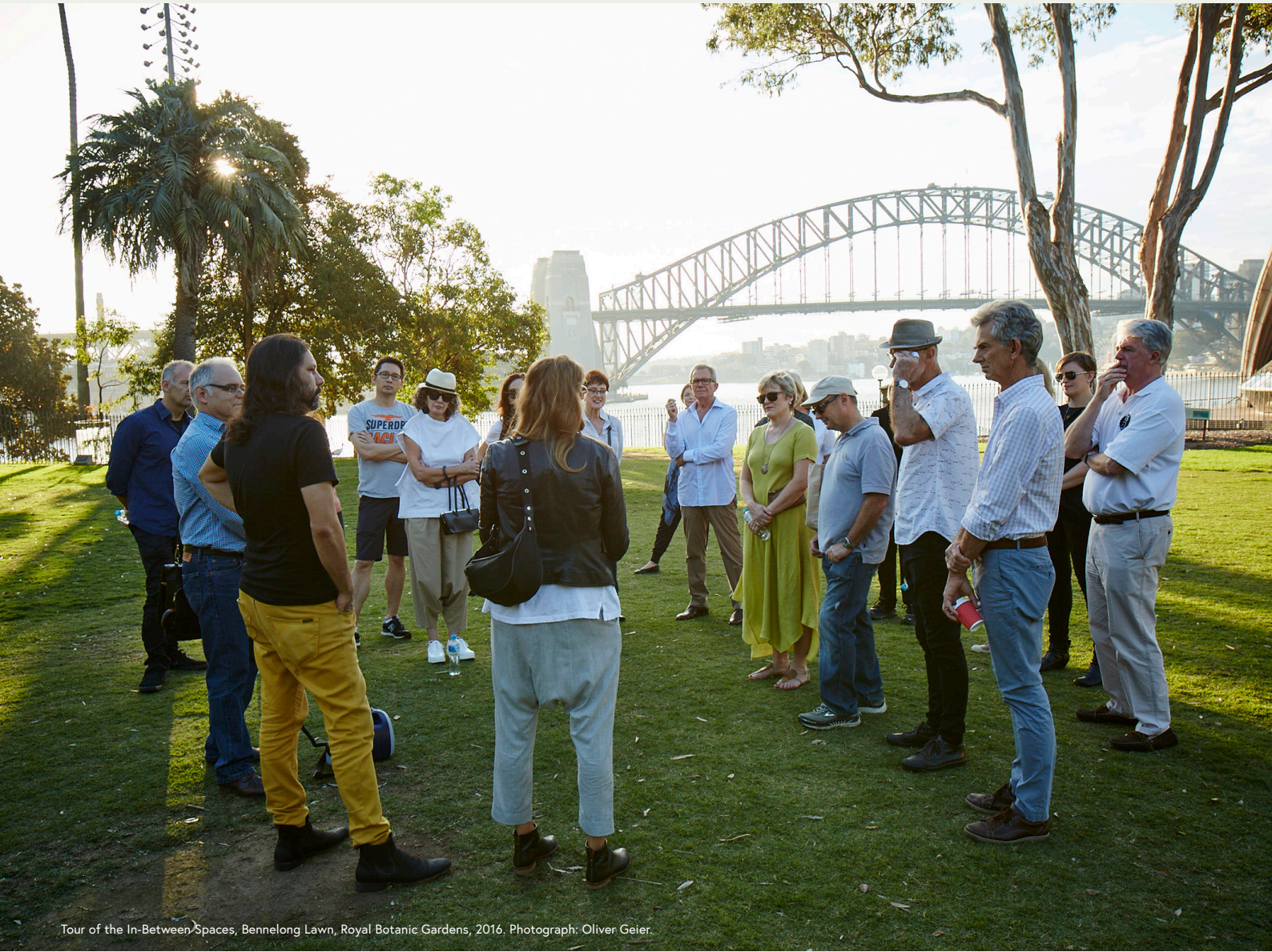
Tour of the In-Between Spaces, Bennelong Lawn, Royal Botanic Gardens, 2016.

*Dates are subject to change. Events listed are indicative of this Biennale edition.