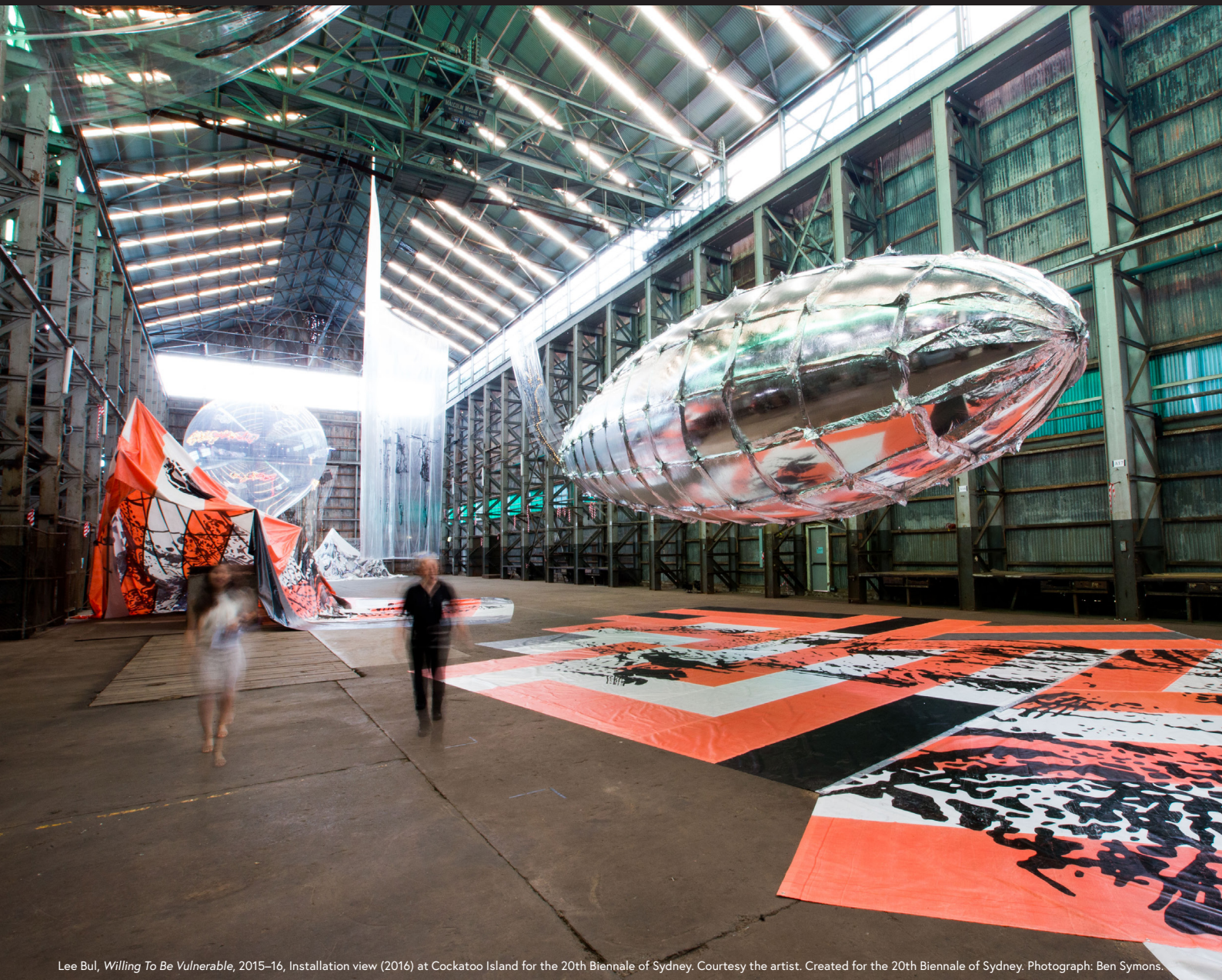
Lee Bul, Willing To Be Vulnerable , 2015–16, Installation view (2016) at Cockatoo Island for the 20th Biennale of Sydney. Courtesy the artist. Created for the 20th Biennale of Sydney. Photograph: Ben Symons.

Art – Ensure contemporary art remains free for all.