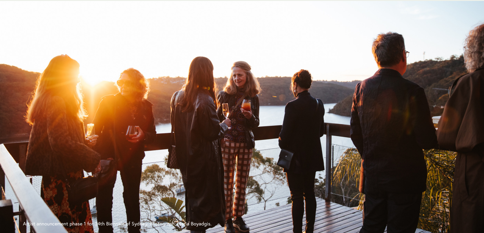
Artist announcement phase 1 for 24th Biennale of Sydney.