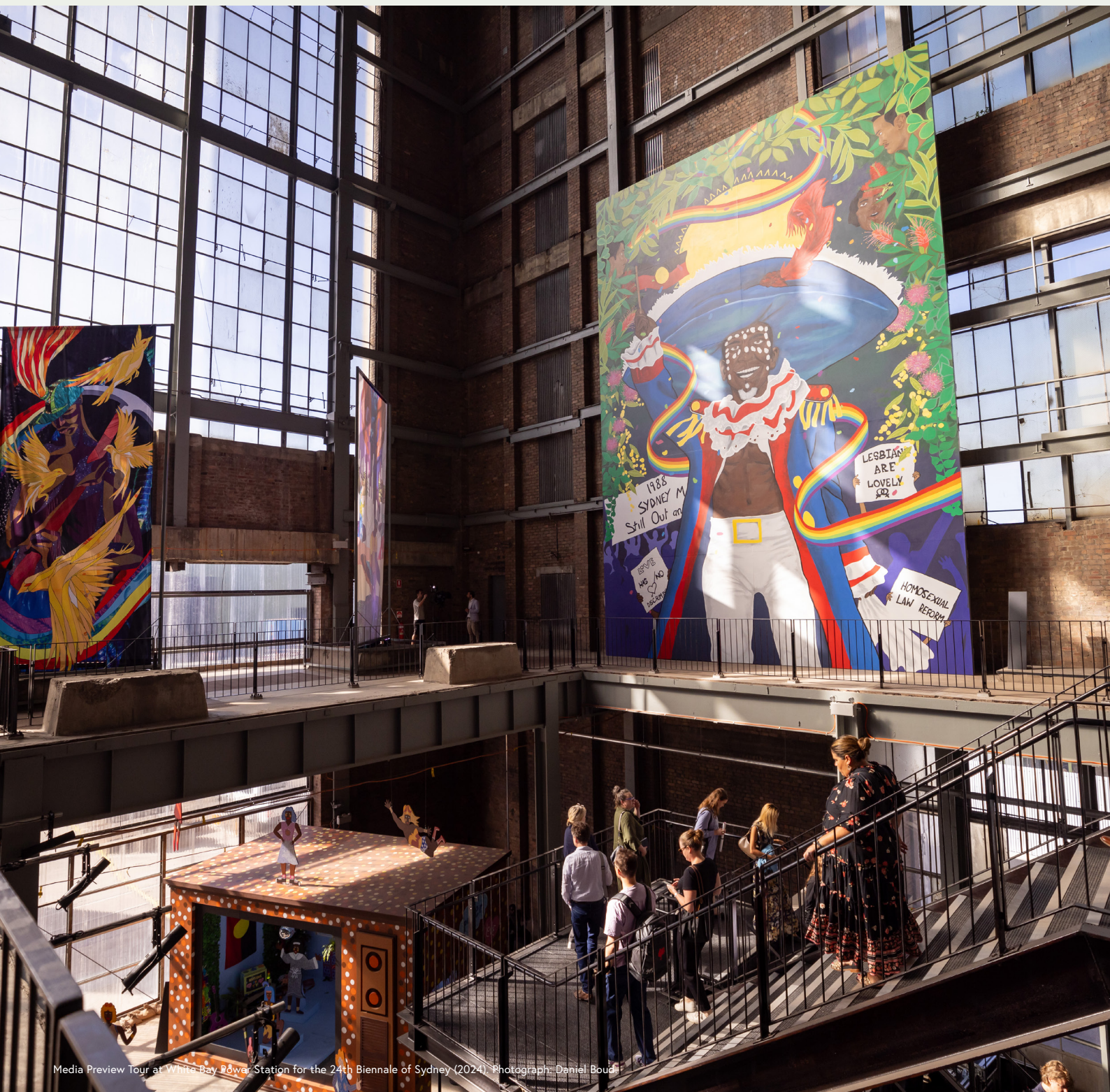
Media Preview Tour at White Bay Power Station for the 24th Biennale of Sydney (2024).