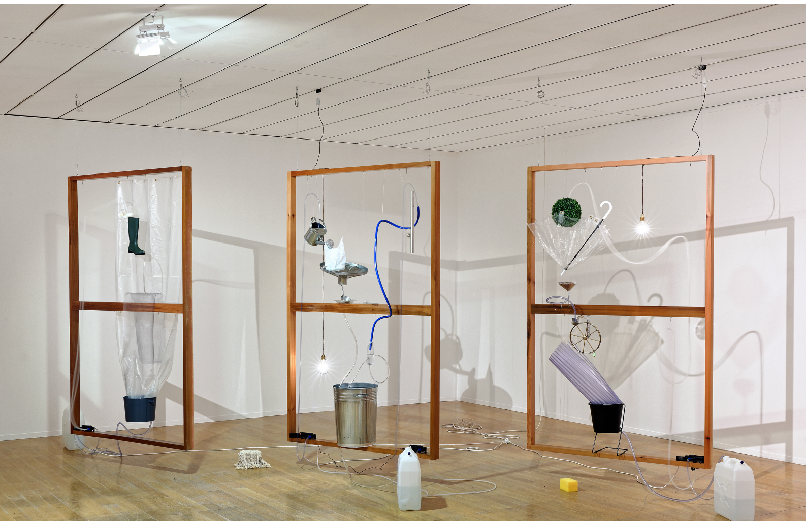
Yuko Mohri, More More (Leaky): The Waterfall Given #4-6 , 2018. Installation view from Biennale de Lyon 2017, Lyon, France.