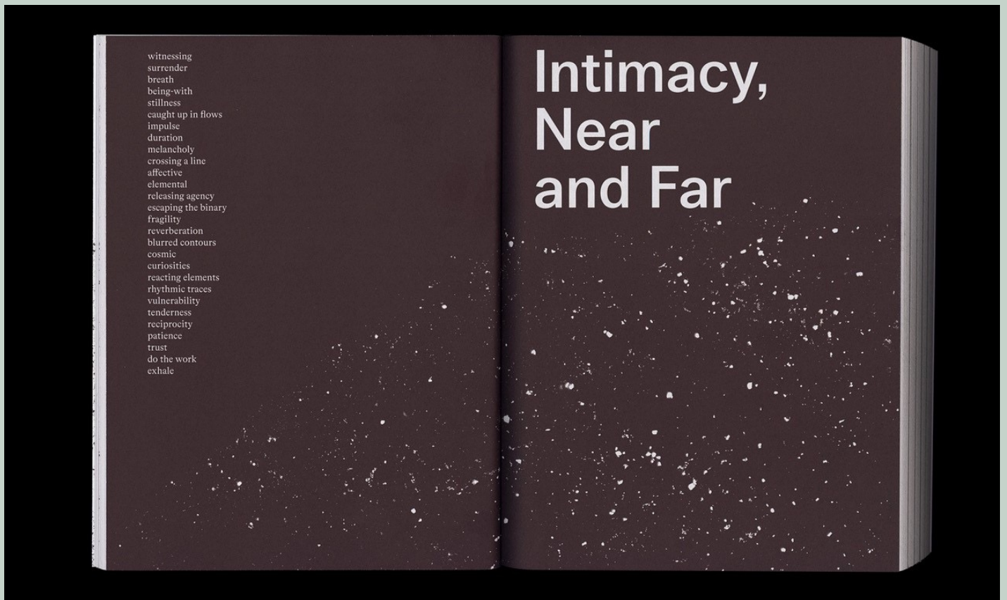
Image: Page spread from Slow Spatial Reader: Chronicles of Radical Affection.