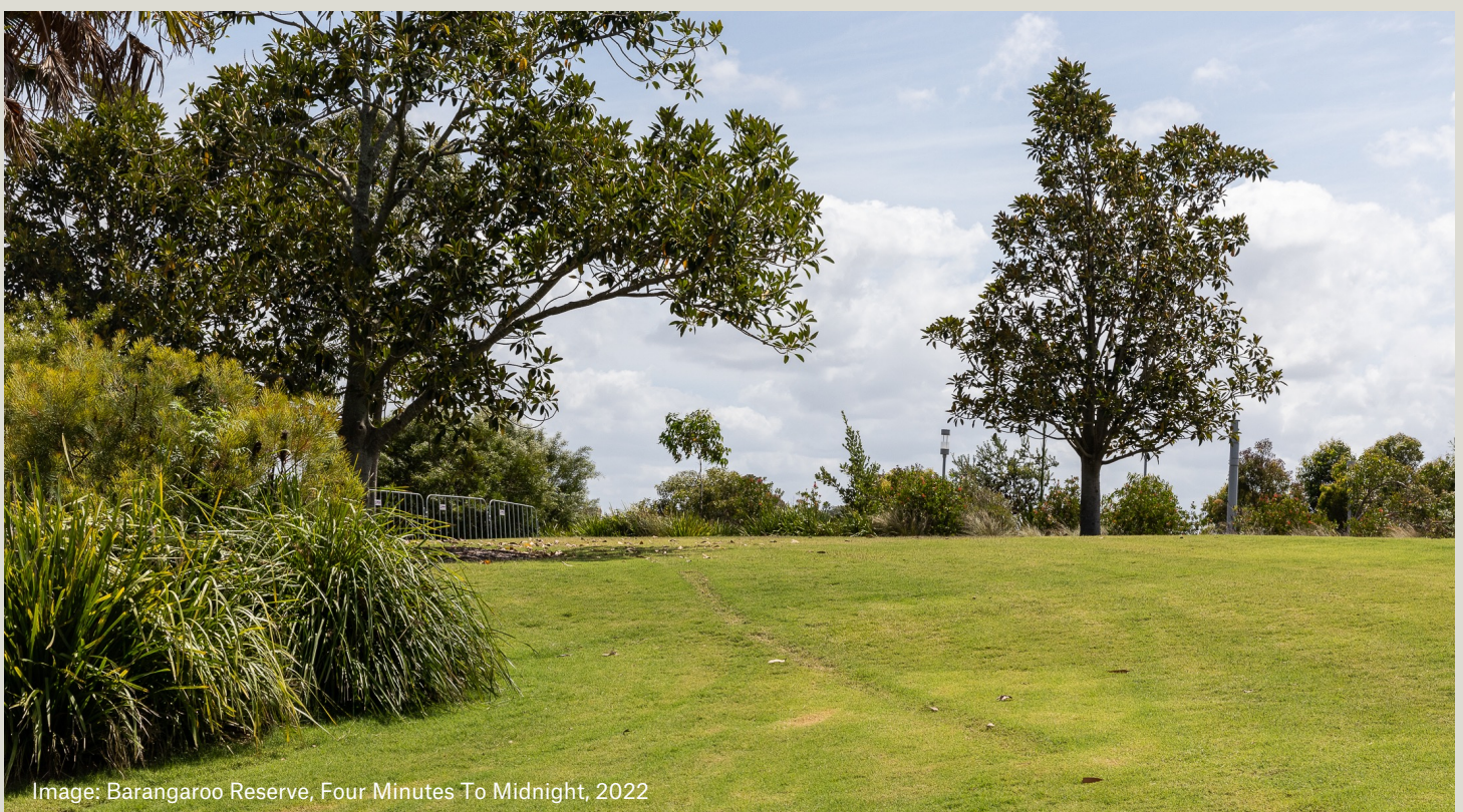
Image: Barangaroo Reserve, Four Minutes To Midnight, 2022