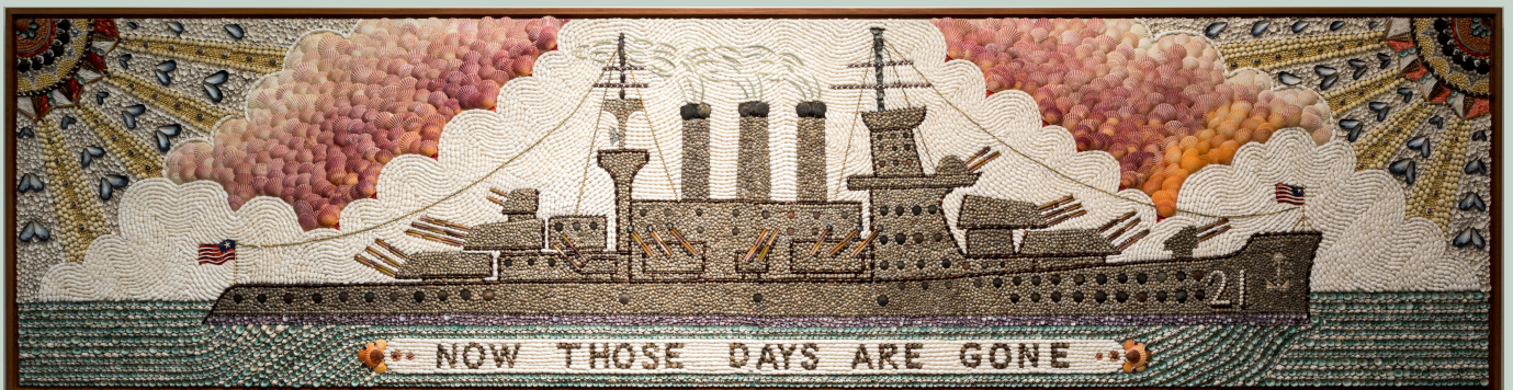
Image: Duke Riley, Now Those Days Are Gone , 2017. Courtesy of the artist.