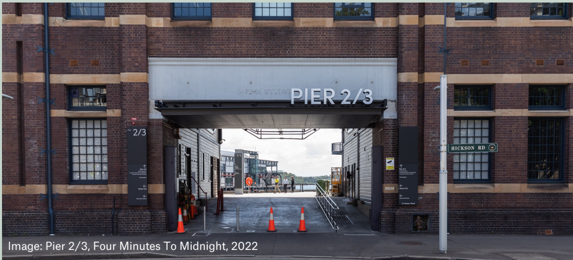
Image: Pier 2/3, Four Minutes To Midnight, 2022

A walkshop from Walsh Bay Arts Precinct to Barangaroo Reserve, where audiences and visitors engage in the material world of the Biennale through music and stories of diverse bodies of water. A moment to engage in thought and sense-provoking micro presentations and exchange between participants and curators.