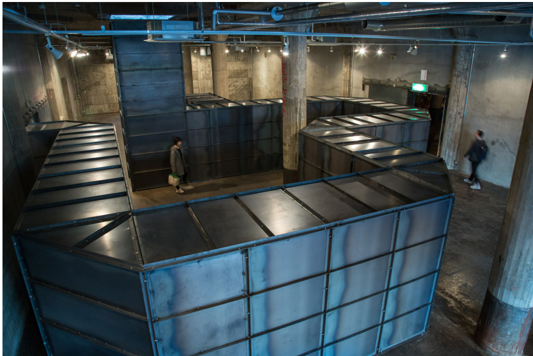
Yukinori Yanagi Icarus Cell , 2016 steel, mirror, sanded glass, video, sound approximately 16.50 m x 11.73 m