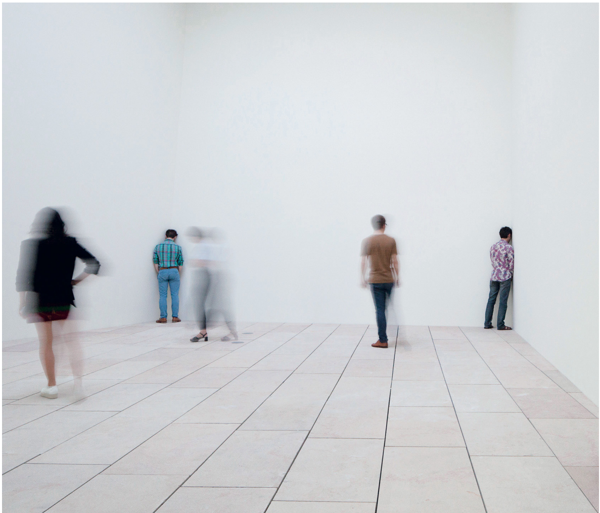
Oliver Beer The Resonance Project , 2014 architectural acoustic performance Installation view at Fondation Louis Vuitton, Paris Courtesy the artist and Galerie Thaddaeus Ropac, London Photograph: Oliver Beer

Oliver Beer: Born 1985 in Kent, England. Lives and works in Paris, France and Kent, England Rayyane Tabet: Born 1983 in Ashqout, Lebanon. Lives and works in Beirut, Lebanon