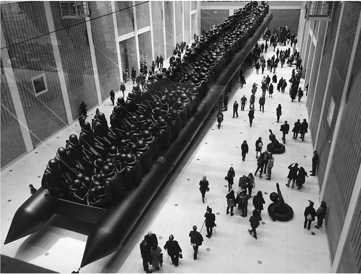
Ai Weiwei Image: Ai Weiwei Law of the Journey , 2017