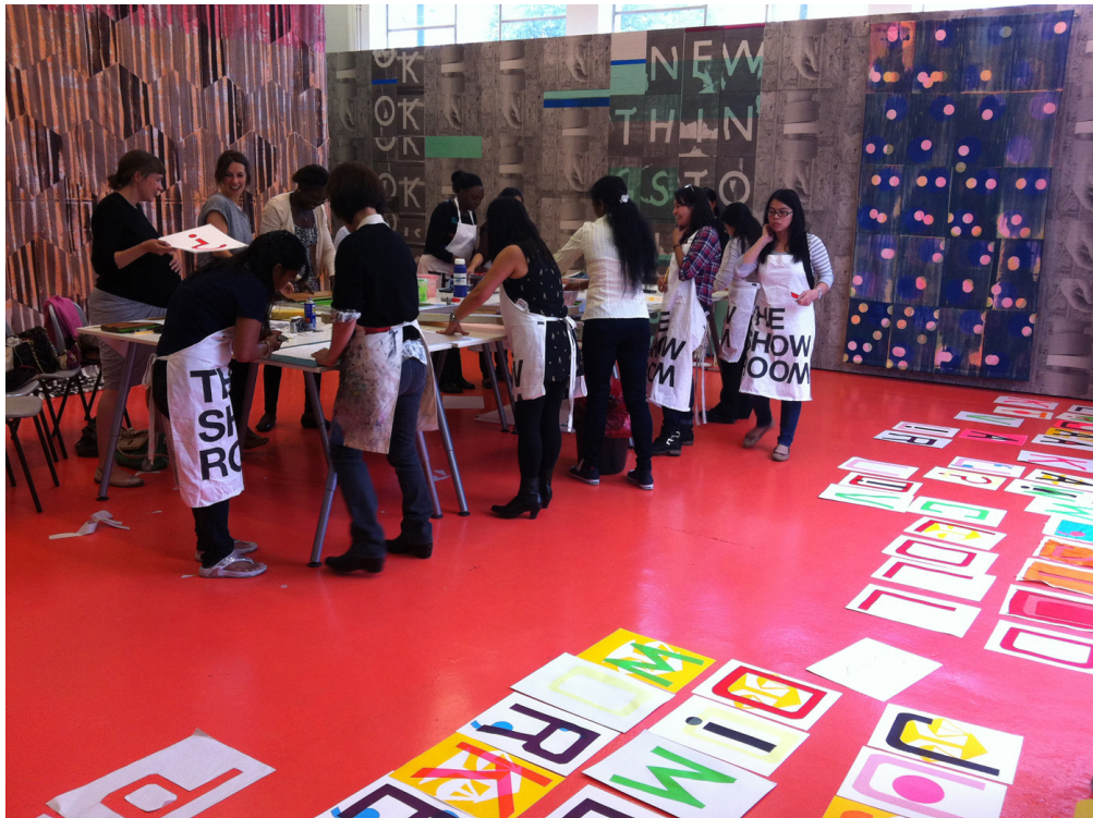
Ciara Phillips Workshop (2010–ongoing) installation and print studio Installation view (2013) at The Showroom, London with Justice for Domestic Workers Courtesy the artist Commissioned by The Showroom, London Photograph: Ciara Phillips